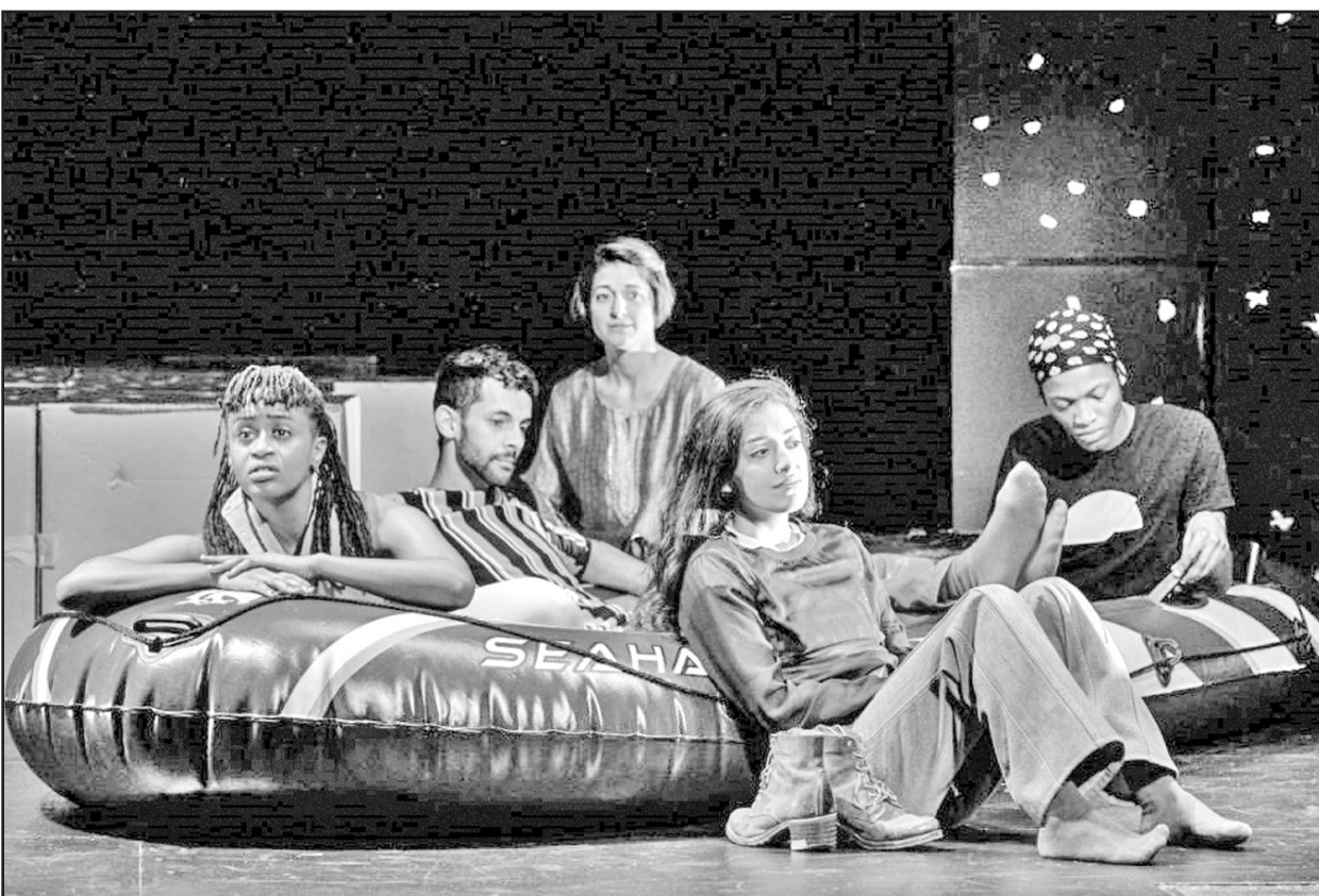
The cast of "Cartography."

The NRV MPO will strive to provide reasonable accommodations and services for persons who require special assistance to participate in this public involvement opportunity. For more information, or to obtain a Discrimination Complaint Form, or to request special assistance email: brughjd@montgomerycountyva.gov or call (540) 394-2145, TTY/TTD 711.