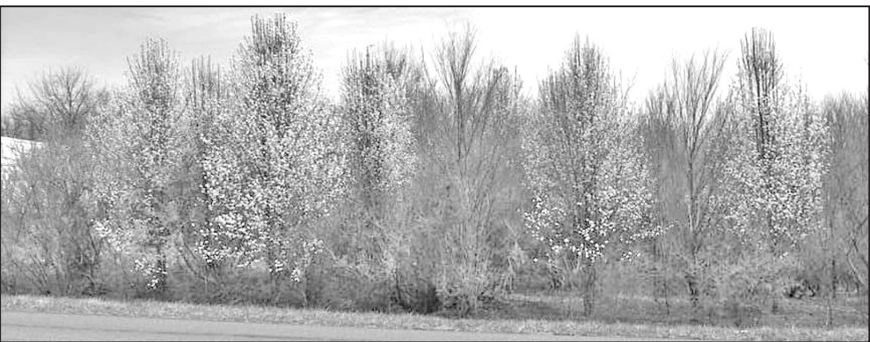
A VT associate professor of urban landscape says that Callery pear trees, such as the Bradford pear, were cultivated as ornamental landscape trees, but as they have spread, they pose a threat to the landscape of both homes and wild areas.

A few nonnative alternatives to Bradford or other Callery pear cultivars that Wiseman suggests are the Japanese tree lilac, crepe-myrtle, tatarian maple, amur maackia, and the Adirondack crabapple.