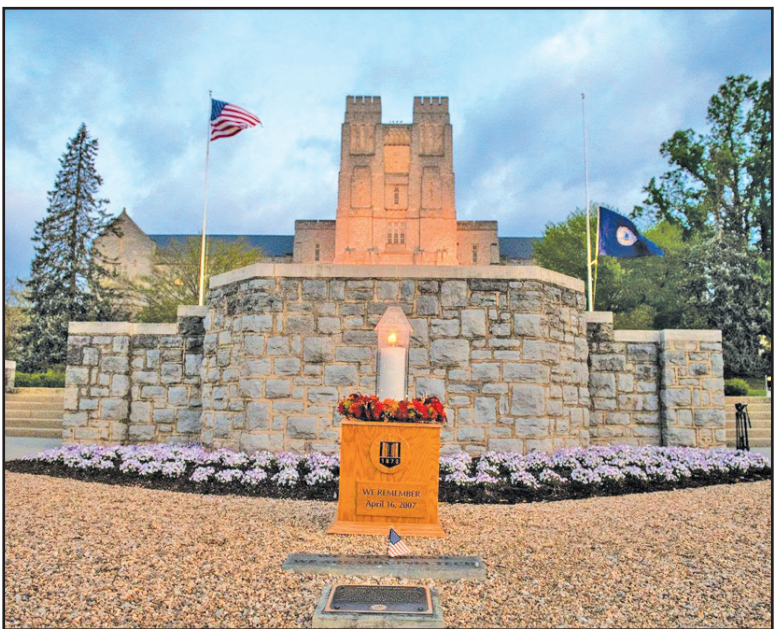
The ceremonial candle will be lit for 24 hours for the 2021 Day of Remembrance.

As was done last year, Virginia Tech's 3.2-mile Run in Remembrance will be offered as a virtual event. Between April 16 and 18, students, staff, faculty, alumni, parents, and all others in the extended community may participate in the