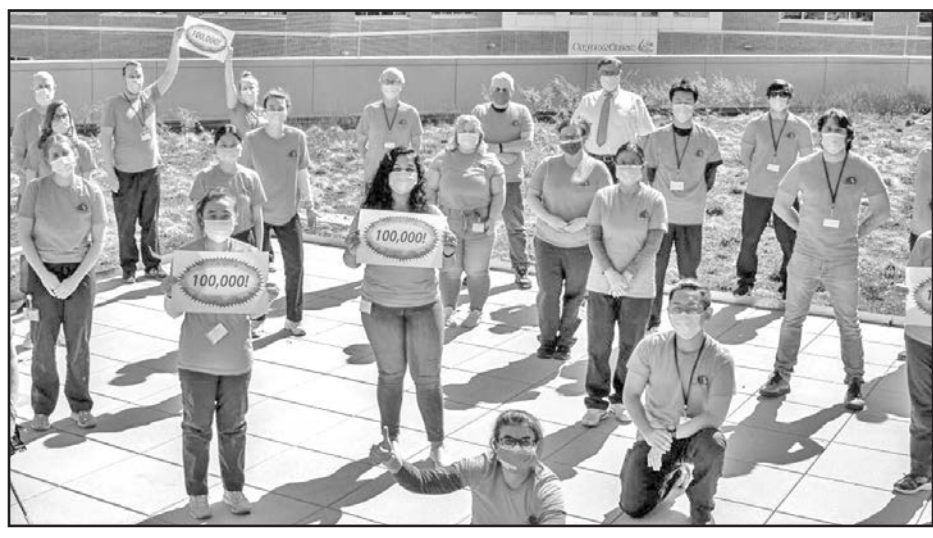
Personnel of the Virginia Tech Molecular Diagnostics Lab at the Fralin Biomedical Research Institute take a moment to mark the occasion of the 100,000th sample analyzed for the COVID-19 virus.