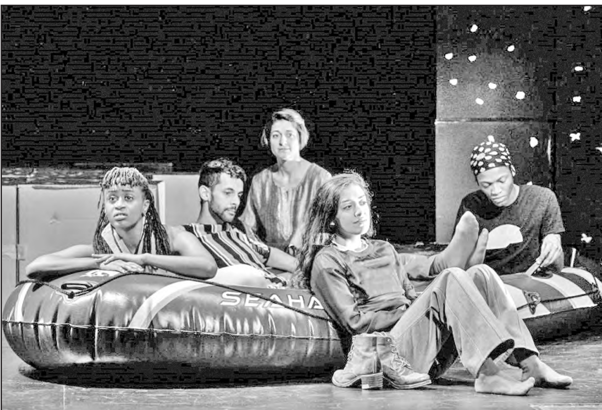
The cast of "Cartography."

The NRV MPO will strive to provide reasonable accommodations and services for persons who require special assistance to participate in this public involvement opportunity. For more information, or to obtain a Discrimination Complaint Form, or to request special assistance email: brughjd@montgomerycountyva.gov or call (540) 394-2145, TTY/TTD 711.