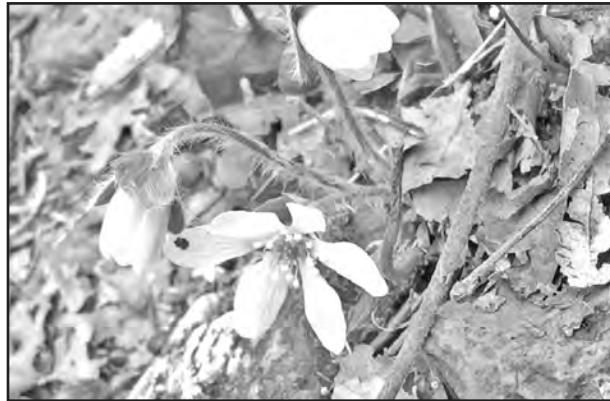
A blossom and buds of Hepatica are visible during a late March stroll at Wildwood Park. Another name for this plant is "Liverwort" because, according to wildflower guide books, it was once believed the leaves promoted liver health.