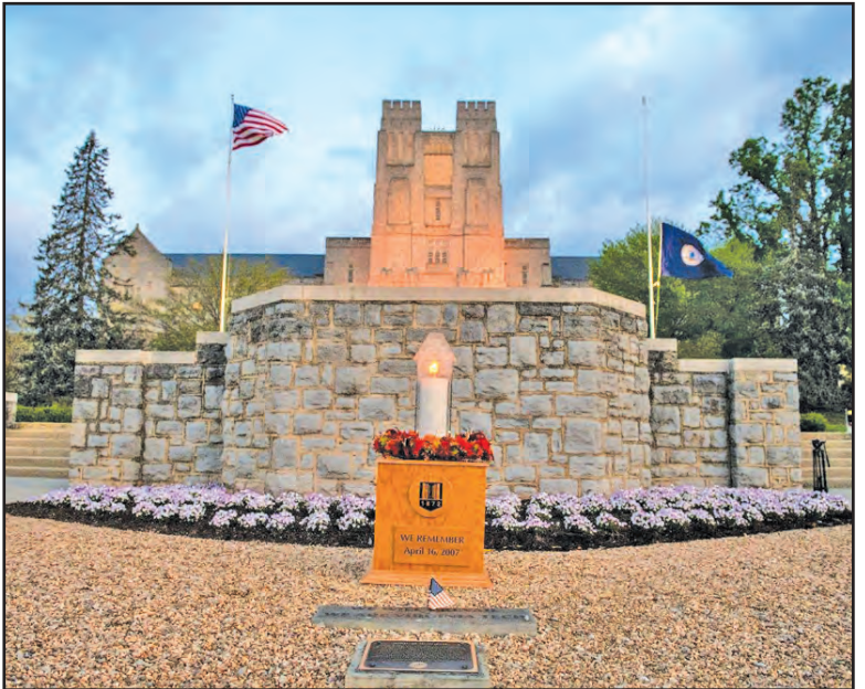
The ceremonial candle will be lit for 24 hours for the 2021 Day of Remembrance.

As was done last year, Virginia Tech's 3.2-mile Run in Remembrance will be offered as a virtual event. Between April 16 and 18, students, staff, faculty, alumni, parents, and all others in the extended community may participate in the