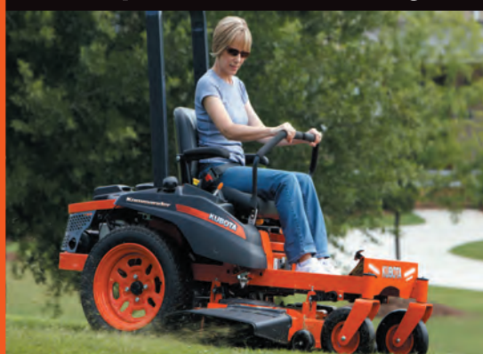
Z-Turn & Riding Mowers