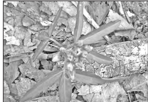
This budding Toothwort emerged at Mid-County Park in late March. More Toothwort was also observed along Dry Run Road as March came to a close.