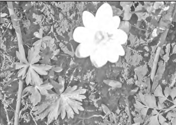
Bloodroot is an early bloomer and is seen here at Wildwood Park in Radford on March 21. This flower's bud is hidden and protected from the cold by its "wraparound" leaf.