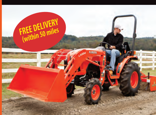
Compact Tractor Packages

Demonstrations • Factory Representatives • Special Pricing