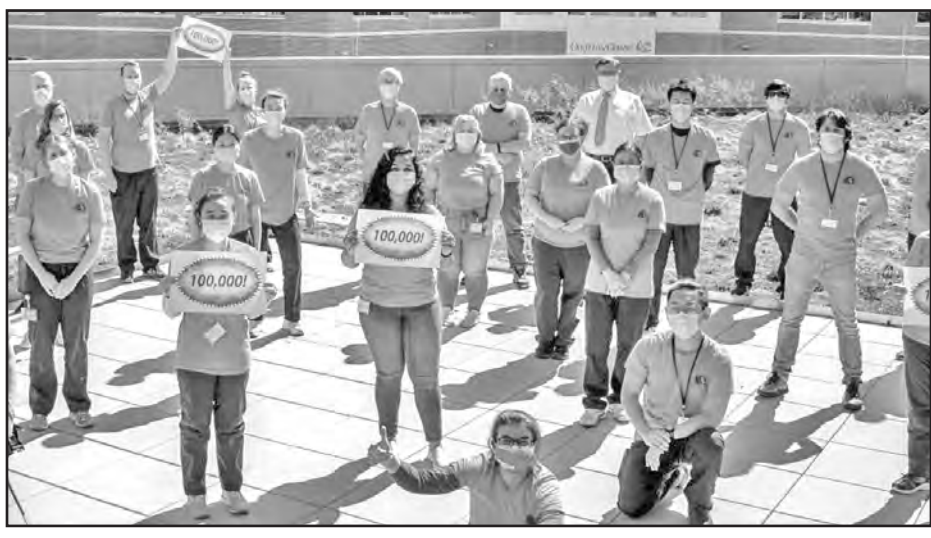
Personnel of the Virginia Tech Molecular Diagnostics Lab at the Fralin Biomedical Research Institute take a moment to mark the occasion of the 100,000th sample analyzed for the COVID-19 virus.