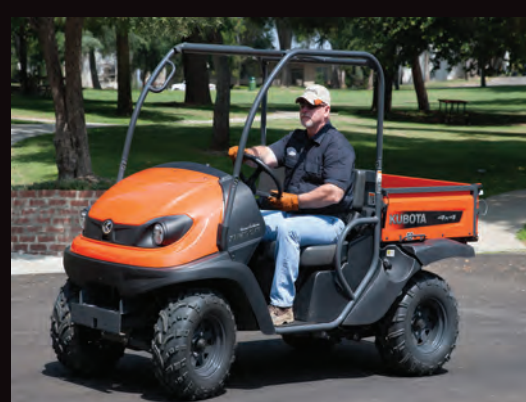
RTV Utility Vehicles