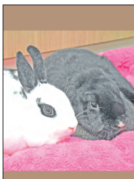
Mini Lop Rabbits Carousel (left) and Bermuda (right) are looking for a home with experienced rabbit owners. They are a bonded pair and will need to be adopted together. Their adoption includes their cage.