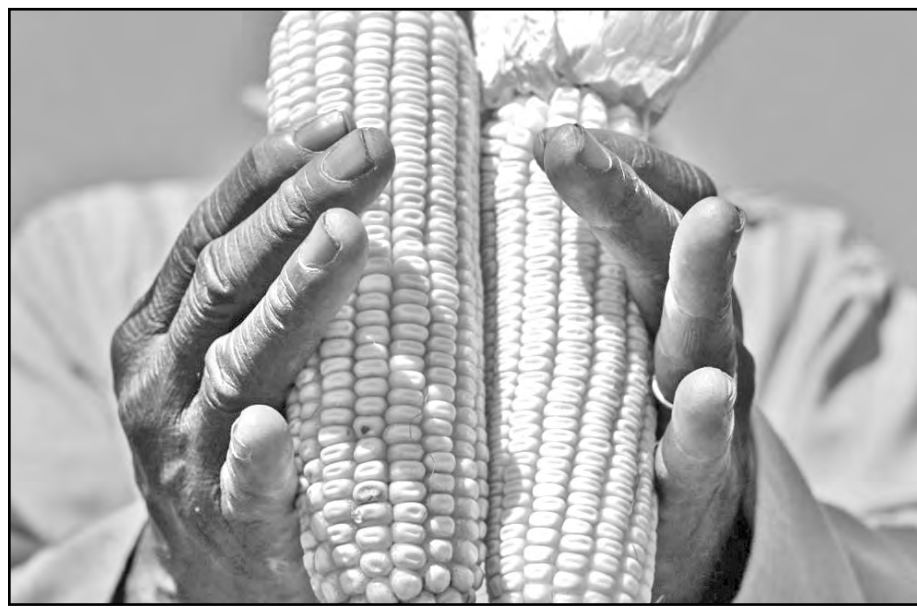
Agricultural productivity growth is imperative for meeting the needs of a growing world while addressing threats to human and environmental well-being.