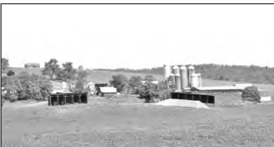
Thoughtless and illegal trash dumping on Virginia farms poses a risk to machinery and livestock.