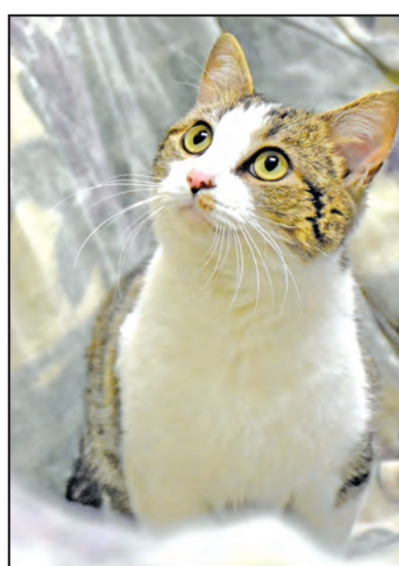
Sweet Jemmi is in search of her purrfect match. Prior to coming to the Animal Care and Adoption Center, she may have been left to fend for herself. Jemmi would do best in a home without dogs as she is a bit timid and may be fearful of them.