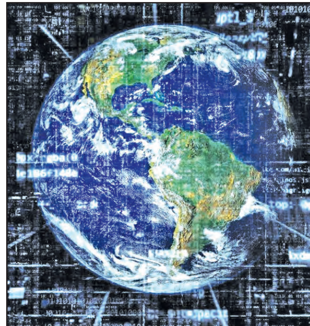
GRAPHIC FROM PIXABAY