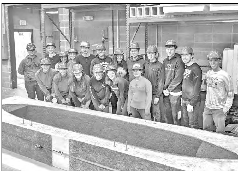
The concrete canoe team with the canoe form in 2019. Because of the pandemic, the 2021 competition was held virtually.