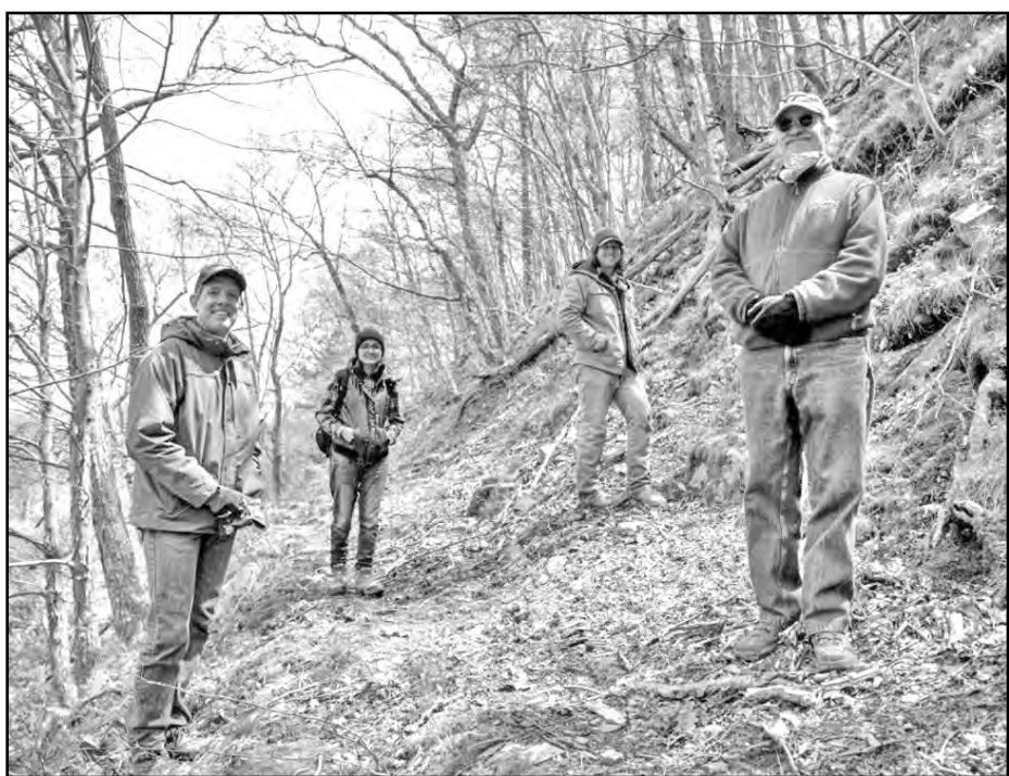
Virginia Tech researchers are working to save the wild, delicious, beloved, and smelly ramps in Appalachia.

On a cool April morning in the fold of the Catawba Valley, leaves crunched underfoot and the air smelled of spring. Through the brown detritus on the forest floor, spikes of green foliage sprung from the earth, telltale signs of the changing of the seasons.