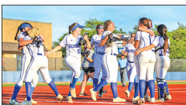
The Auburn High Eagles celebrate Wednesday after getting the last out and advancing to the state 1A championship game against Rappahannock.