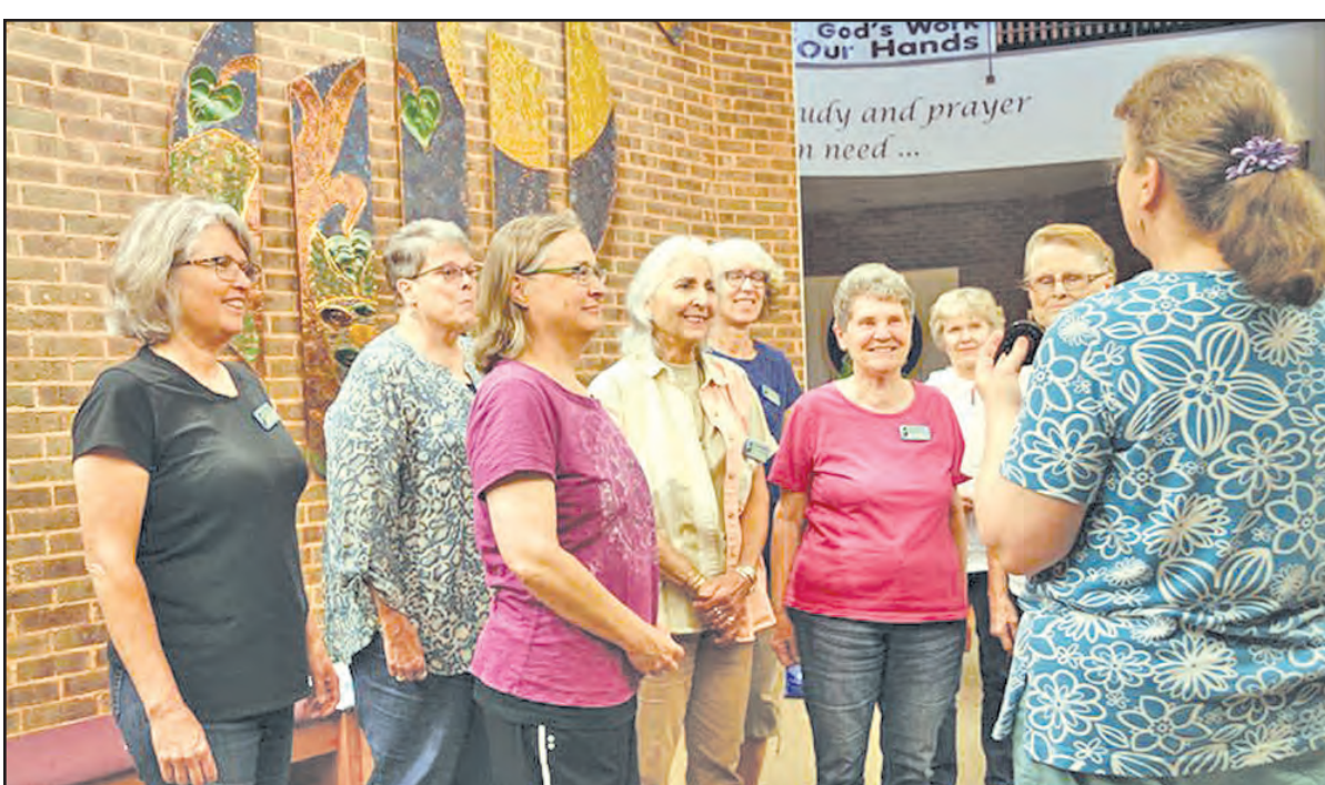
The women's Wilderness Road Chorus has been performing at community events for more than 30 years. After a year of COVID-19 restrictions, the chorus is back rehearsing indoors again.