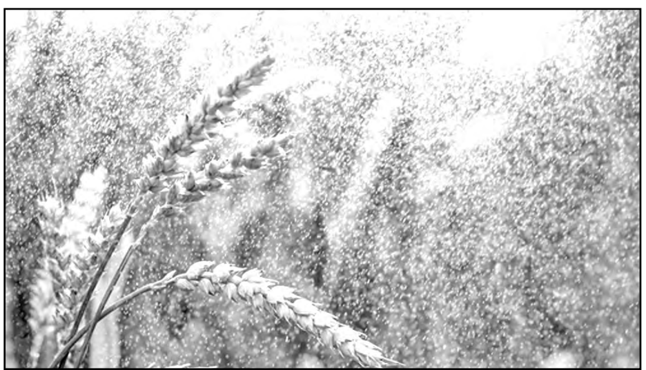
After several weeks of little or no rain in April and May, June has brought enough rain to raise topsoil moisture to adequate levels across three-quarters of the state.

“It still might damage the yield potential, but it’s doing less damage to the yield potential than if it was later, with the plants much bigger and requiring so much more water,” Harper said.