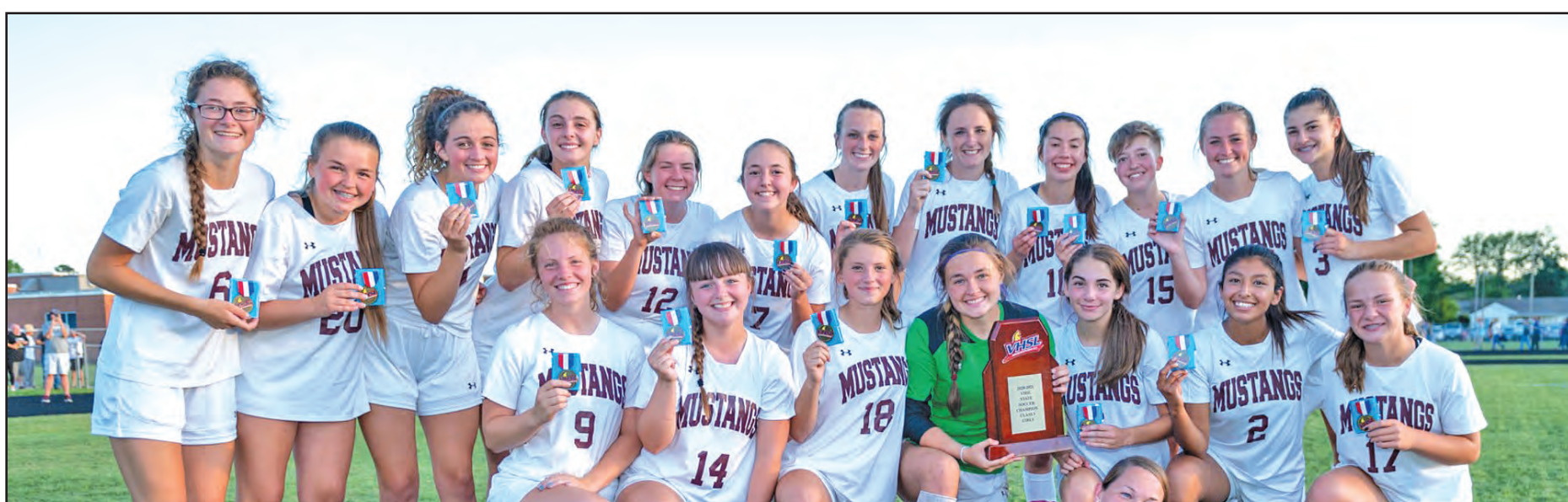
The Eastern Montgomery High School girls soccer team captured the 2021 Class 2 state championship on Wednesday.