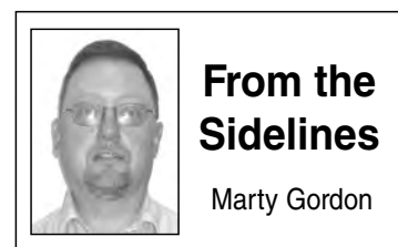
From the Sidelines

Off the field in Blacksburg on Friday night, a lot of things