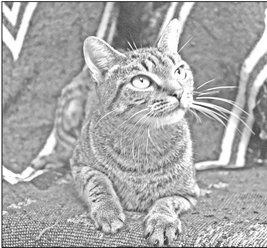
Shelby is a young momma cat whose kittens have found homes. Now it's her turn to be loved and nurtured. Shelby is a sweet gal. She enjoys receiving affection and will happily roll over for a nuzzle.