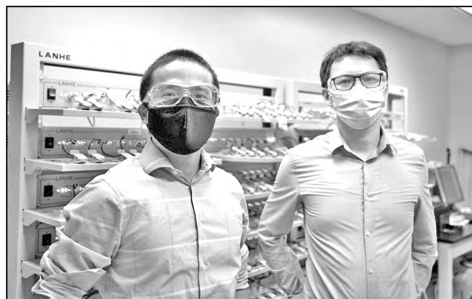
VT associate professors Haibo Huang and Feng Lin have discovered that removing certain specific compounds from food waste left essential compounds behind that could sufficiently work for a battery.

What do apple cores, spent grain, and walnut shells have in common? They could one day be used to power a data center.