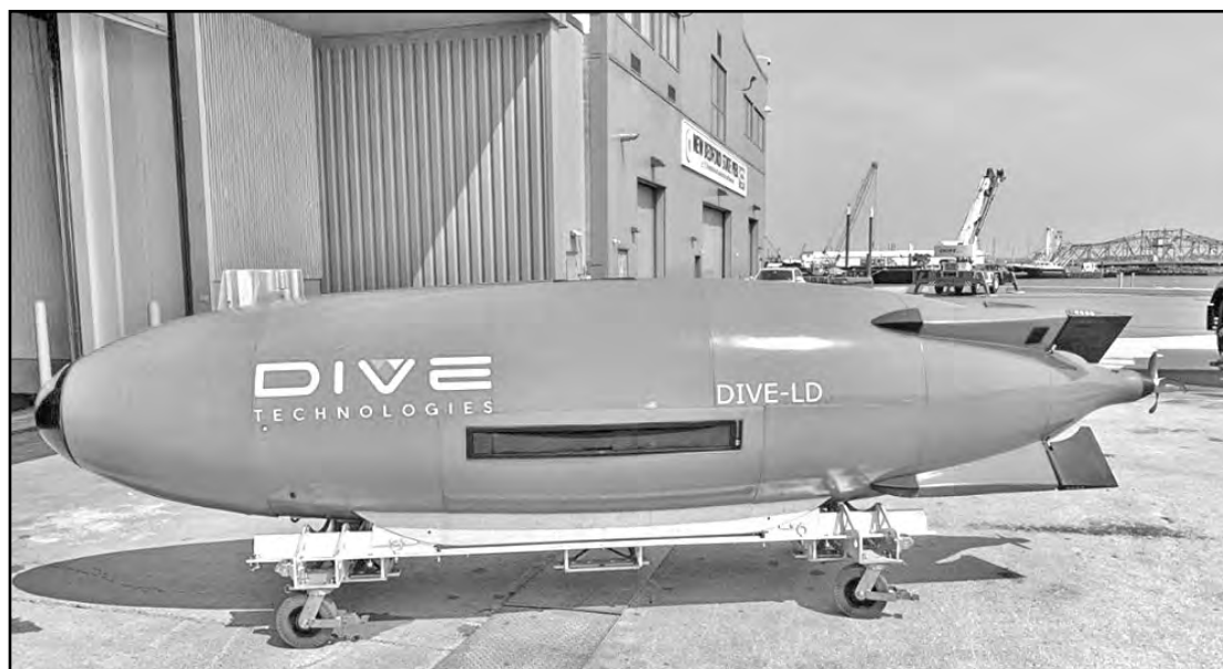
Virginia Tech ocean engineering researchers and students have supported the mission of Dive Technologies through development and testing of the DIVE-LD autonomous underwater vehicle, pictured above, which exceeded performance expectations at the first round of sea trials in Massachusetts in late 2020.

The team conducted sea trials of the DIVE-LD in the waters of Cape Cod Bay and Buzzards Bay, an hour south of Boston. Throughout August to December 2020, Dive Technologies ran more than 250 missions and put a significant number of hours on the test vehicle. Due to the global COVID-19 pandemic, Stilwell, Brizzolara, and their students were unable to travel to the sites for offshore testing. Both groups stayed connected throughout the trials through email, virtual meetings, and the occasional offshore phone call in order to quickly analyze test results and make rapid corrections along the way.