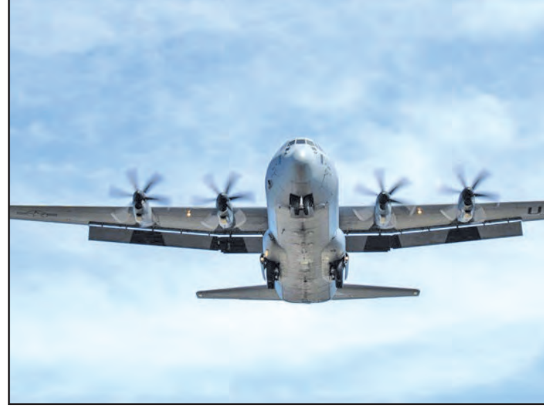
An Air Force C-130J Super Hercules in flight.

And more than 200 Corps of Cadets alumni will march onto the field during the pregame ceremonies to honor our flag during the National Anthem.