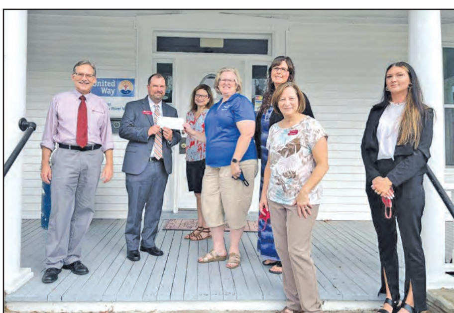
Carter Bank & Trust presents a check to the United Way NRV for its Carter Cares program. United Way will kick off its 2021 workplace campaign virtually on Sept. 23.

United Way NRV will kick off its 2021 workplace fundraising campaign virtually on Thursday, Sept. 23, 2021, from 9:30 to 10:30 a.m.