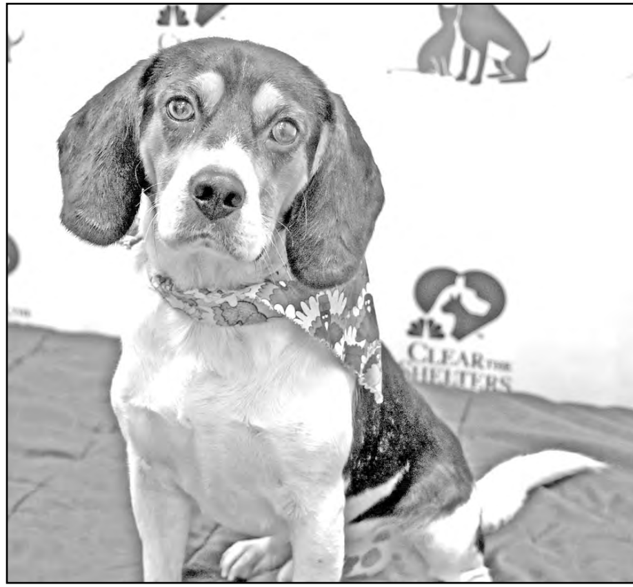
Bubba loves the great outdoors where he can put his sniffer to good use. He can be a playful pup, too. Bubba's future home will need to provide him with some basic doggie manners and training.