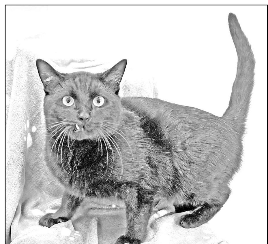
Moonshadow is a curious cat in search of his purrfect match. He likes attention and affection. He also has a visible tooth that peeks out of his mouth. It may be the result of a broken jaw, but it doesn't appear to hamper Moonshadow's enjoyment of tasty treats.