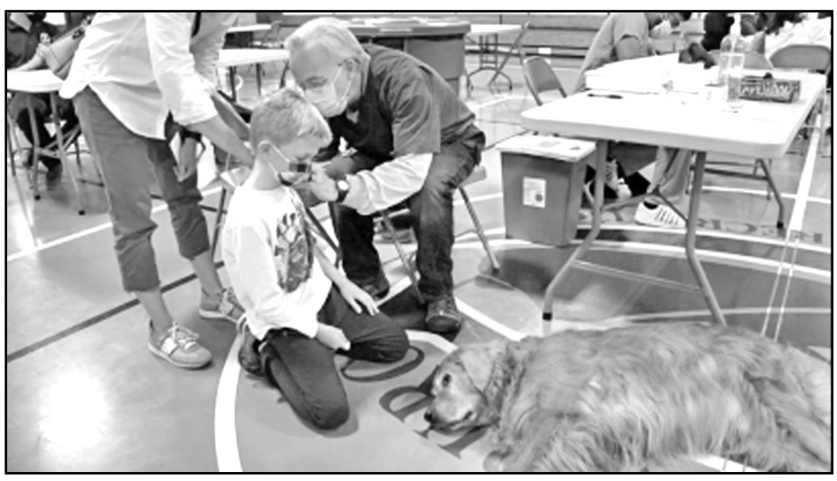
Children get vaccinated at an NRV clinic for 5- to 11-year-olds.

The Virginia Department of Health's New River Health District held two large-scale COVID-19 vaccine clinics for children ages 5-11 Thursday and Friday.