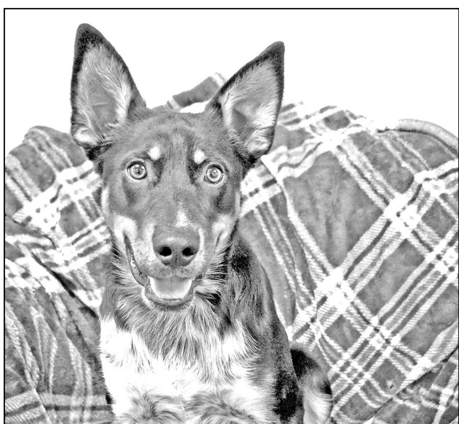
Mitch is a friendly, playful dog who is ready to find a pawsome home. He gets along well with other dogs and would make a good hiking partner. Some situations make him a little nervous, but when given time, he warms up and gets comfortable, showing his happy personality.