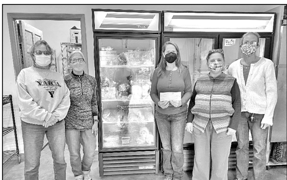
The local nonprofit organization Plenty! receives its check for $4,000 from Community Foundation's 2021 Responsive Grant Program.

awards, listed alphabetically, were Adaire Theatre: $4,000; Beans and Rice, Inc: $4,000; Blacksburg Interfaith Food Pantry (NRCA): $1,800; Blacksburg Museum and Cultural Foundation: $1,000; Bland Ministry Center: $3,500; Blue Mountain School: $2,000; Brain Injury Services of SWVA: $3,500; Calfee Community and Cultural Center: $4,000; Cayambis Institute for Latin American Studies in Music: $804; CHIP of the NRV (NRCA): $2,000; Children's Trust - NRV Children's Advocacy Center: $2,148; College Mentors for Kids: $3,120; Emergency Assistance Program (NRCA): $2,000; Emergency Needs Task Force of Pulaski County: $4,000; Family Resource Center: $2,000; Fine Arts Center for the NRV: $500; Free Clinic of Pulaski County: $4,000; Floyd Center for the Arts: $2,000; Floyd County Historical Society: $1,000; Floyd County Humane Society: $1,000; Giles Animal Rescue: $1,000; Giles County Christian Service Mission: $4,000; Giles Health and Family Center: $2,000; Giles County Shelter: $4,000; Goodwill Industries of the Valleys: $100; Habitat for Humanity of the NRV: $2,100; Healthy Floyd: $1,000; Help Overcom-