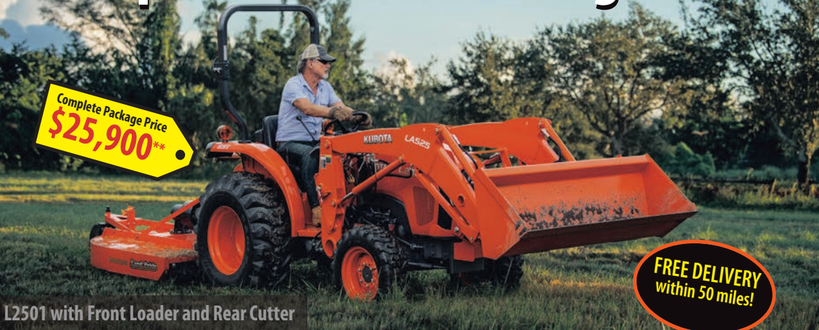
L2501 with Front Loader and Rear Cutter