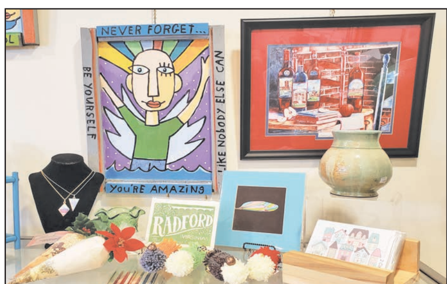
Opening today, Nov. 27, a new exhibit at Glencoe Mansion, Museum, & Gallery displays the works of six local artists.

More information about the library is available at www.mfml.org . More information about the tests is available at http://www.vdh.virginia.gov/covid19testing or by emailing testinginfo@vdh.virginia.gov .