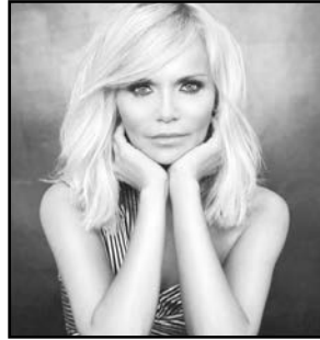
Four-time Grammy winner Angelique Kidjo will blend the music of her West African traditions with R&B, funk, and jazz on Thursday, Jan. 20, at 7:30 p.m. at the Moss Arts Center.

The Moss Arts Center offers a spring lineup of events filled with diverse, powerful, and inspiring perspectives, from international singing sensations and dynamic music ensembles to family-friendly favorites and a Broadway blockbuster.