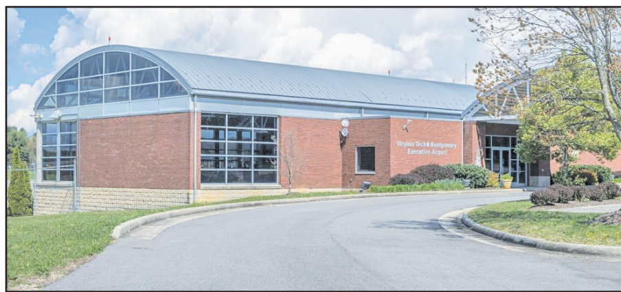
Virginia Tech/Montgomery Executive Airport is slated to receive $1,480,000 over the next five years from the Infrastructure Investment and Jobs Act.