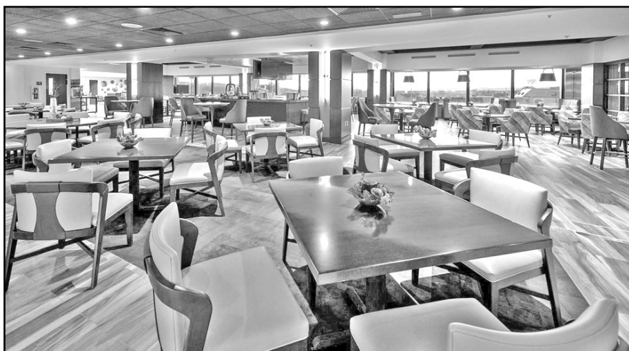
Located inside the President's Suite of Lane Stadium, the University Club of Virginia Tech will serve as a place for members and guests to host, connect, work, play, and celebrate.

In addition to all benefits included in the social membership, the XLife membership offers: • 50% off a la carte dining during every visit. • Local and travel dining benefits. • 50% off a la carte dining at all stadium clubs. • Dining access at participating golf clubs and city clubs. • Travel golf benefits. • Access to the club collection based on your home club and destination club (participating clubs may vary). • 12 rounds of golf per year, up to two rounds per club, per month, per participating club (play rates and cart fees apply). • 25-day advance tee times. • Access to premium Callaway rental clubs at a preferred rate ($25 per set, subject to availability).