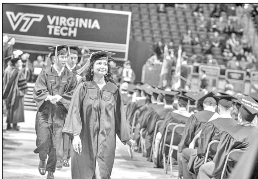
Virginia Tech's Class of 2021 will celebrate fall commencement on Friday, Dec. 17, at Cassell Coliseum.

More details are available at vt.edu/commencement.