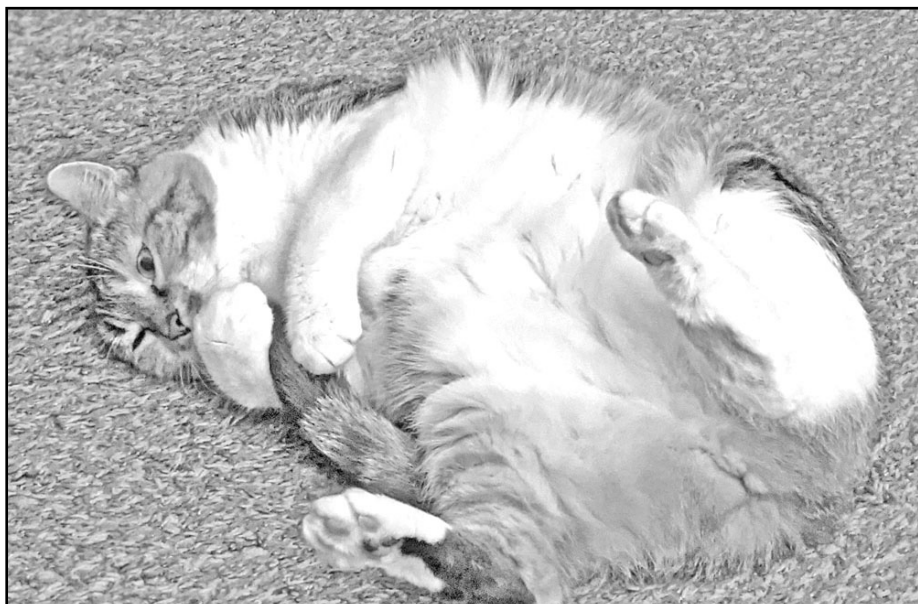
Pearl--or Pearly Whirly--as her foster family calls her, is a sweet gal who enjoys cuddling with her humans on the couch, eating snacks, and chasing laser pointers. When she is comfortable and adjusted to her surroundings, Pearl enjoys giving and receiving affection. She would do best in a quiet home without small children since she startles easily. She also prefers being the only pet in the home.