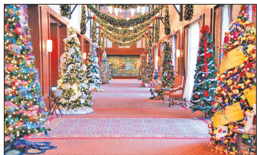
The halls of The Inn at Virginia Tech and Skelton Conference Center are decked out for the annual Fashions for Evergreens decorated tree contest. Visitors can vote for their favorites until Dec. 12.