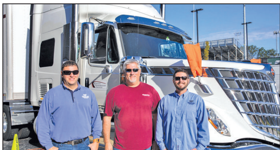
Researchers with the Virginia Tech Transportation Institute have developed a curriculum to educate teen drivers on how to apply safe driving practices when they encounter large commercial vehicles.