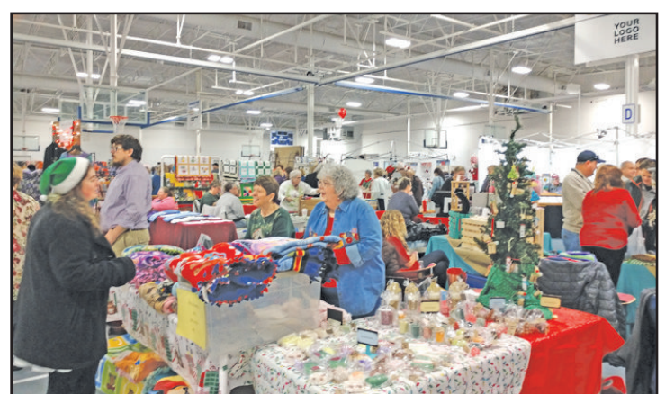
Between 3,500 and 4,000 shoppers turned out to support the Christiansburg Lions Club's 30th annual holiday craft show in December with the money raised used by the club to support various charities and club projects.

Twenty-two silver sponsors also contributed to help the show reach its financial goal. Several sponsors also helped support the show's snack bar: Kroger, Food Lion, Hardee's, Walmart, Pizza Inn, Papa John's Pizza, and Little Caesar Pizza.