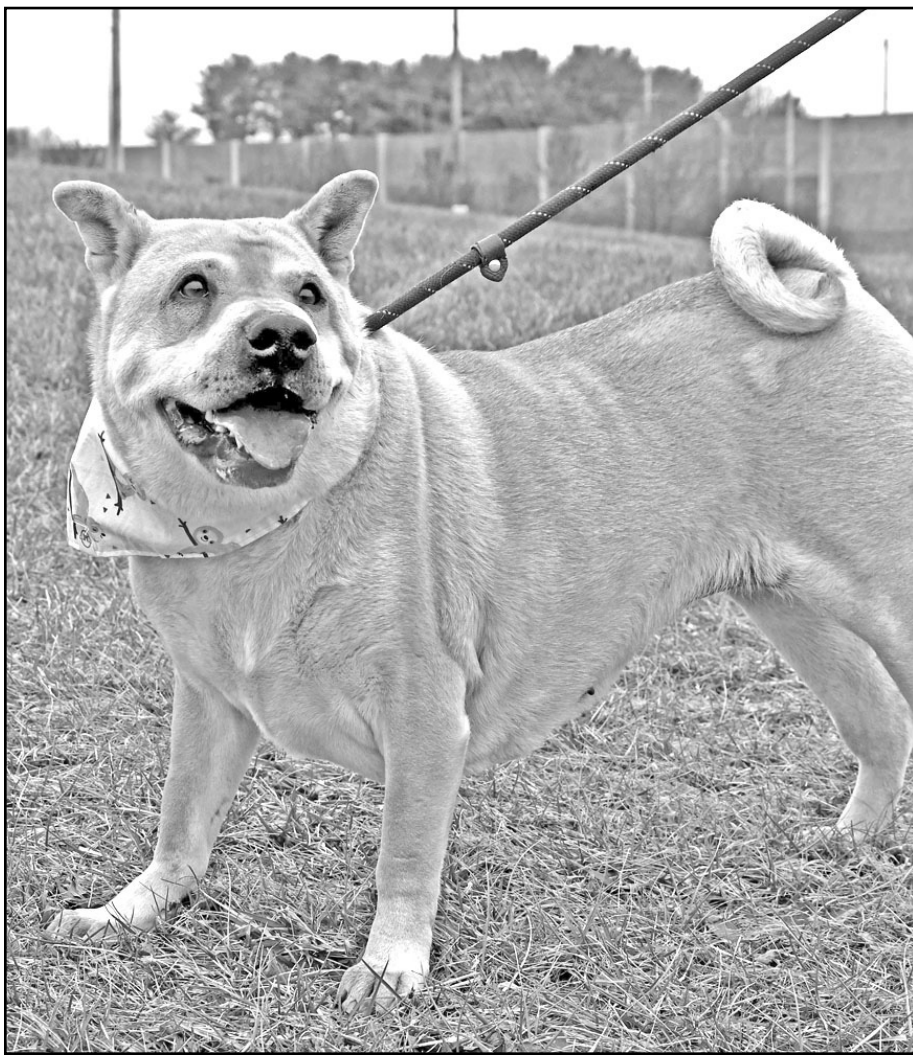
Yuno is ready to find her forever home. She may do best where she can keep her attention focused on her favorite human, as opposed to living with a large family. Yuno appears to have good indoor doggie manners: staying off furniture and waiting until outside to take care of business.