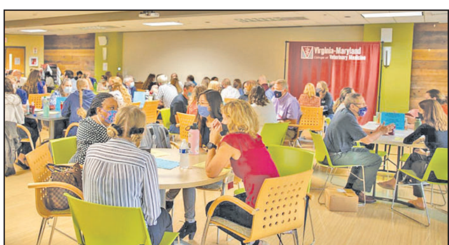
Mentor Day setup conversations tailored to both student and mentors' interests.