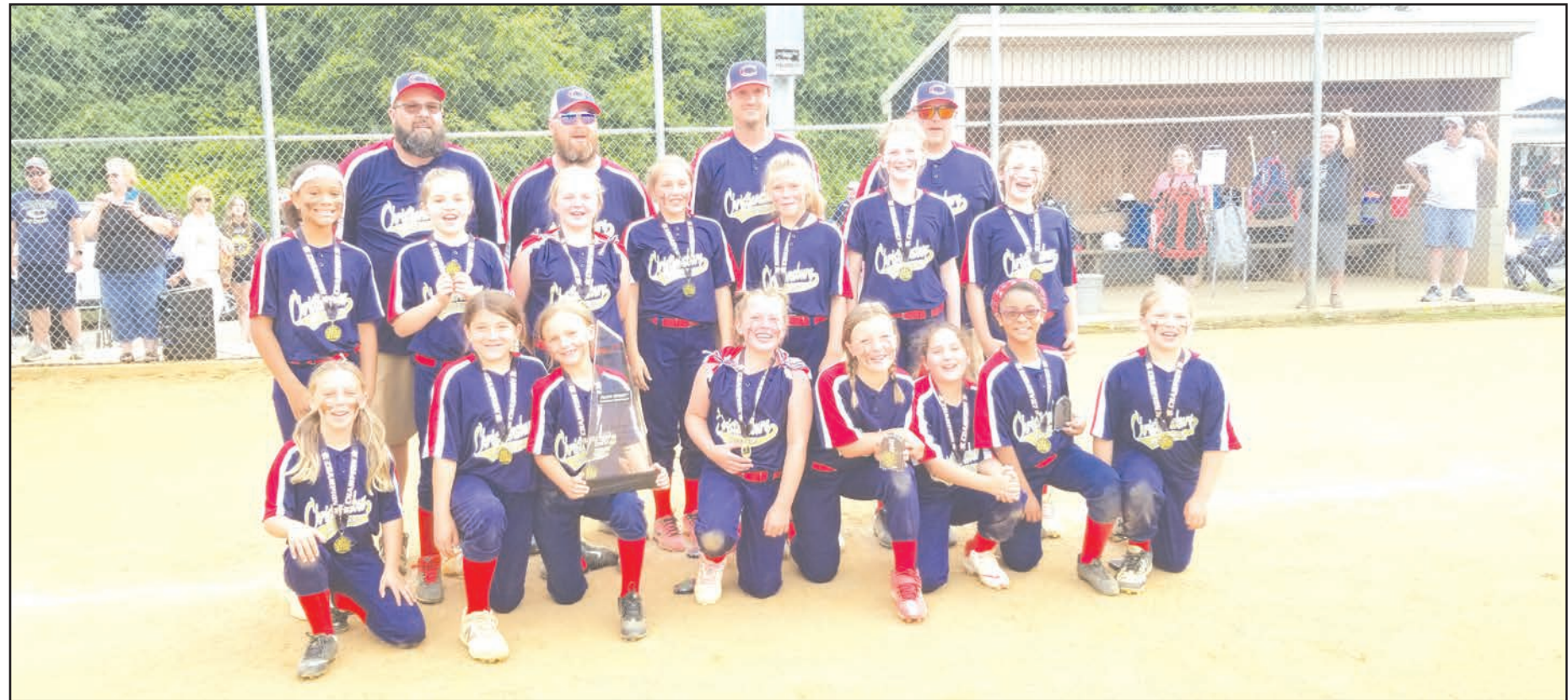
The Christiansburg Parks and Recreation Department's Under-10 all-stars won the District 10 Babe Ruth tournament held this past weekend in Floyd.