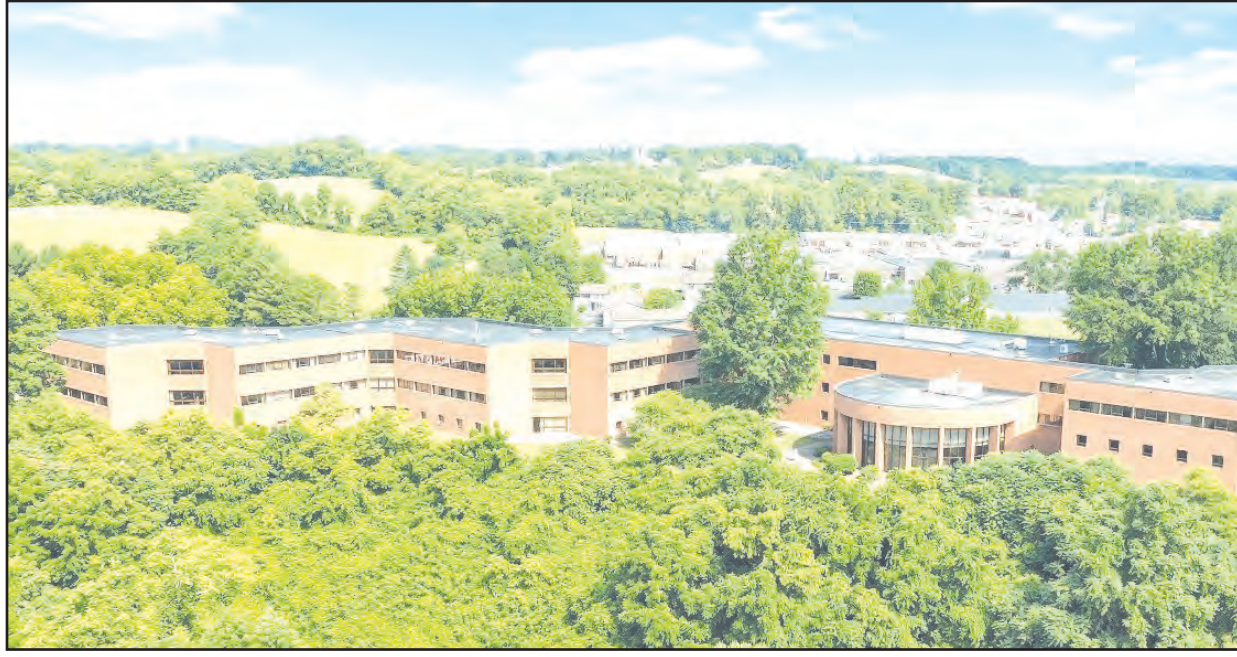
Waldvogel Commercial Properties has sold the building and property at 6226 University Park Dr. in Radford for $4,310,417. Currently owned by the RU Foundation, the purchaser, Pyramid Healthcare, Inc., will transition the property back to use as a healthcare facility.

Formerly St. Albans Psychiatric Hospital, the building was repurposed for office use when owned by The Radford