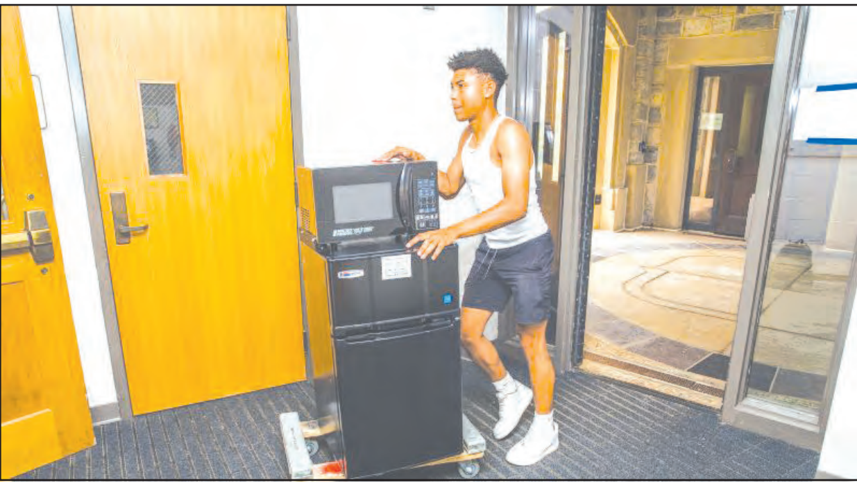
MicroFridge units were delivered and installed in Virginia Tech's residence halls during a two-week period in early June.

fering a variety of treatment and recovery services for adults and teens. Founded in 1999, Pyramid Healthcare is now one of the largest providers of behavioral healthcare in Pennsylvania, Maryland, New Jersey, and Virginia.