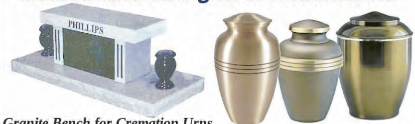
Granite Bench for Cremation Urns