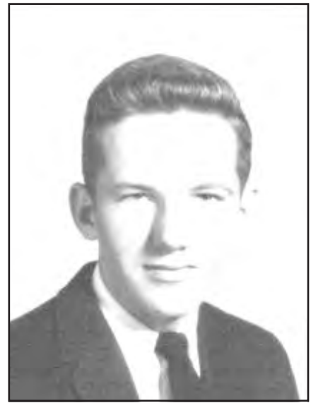
See Obituaries, page 6