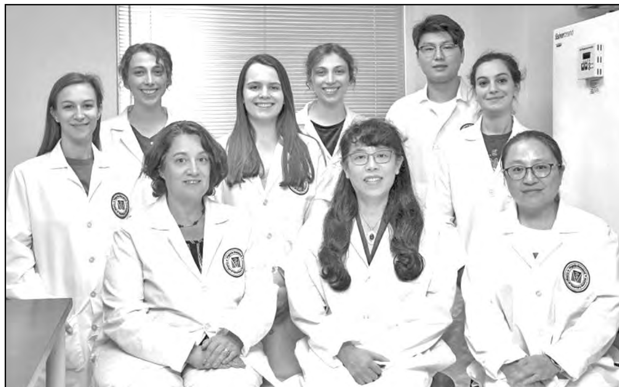
The Yuan laboratory team.