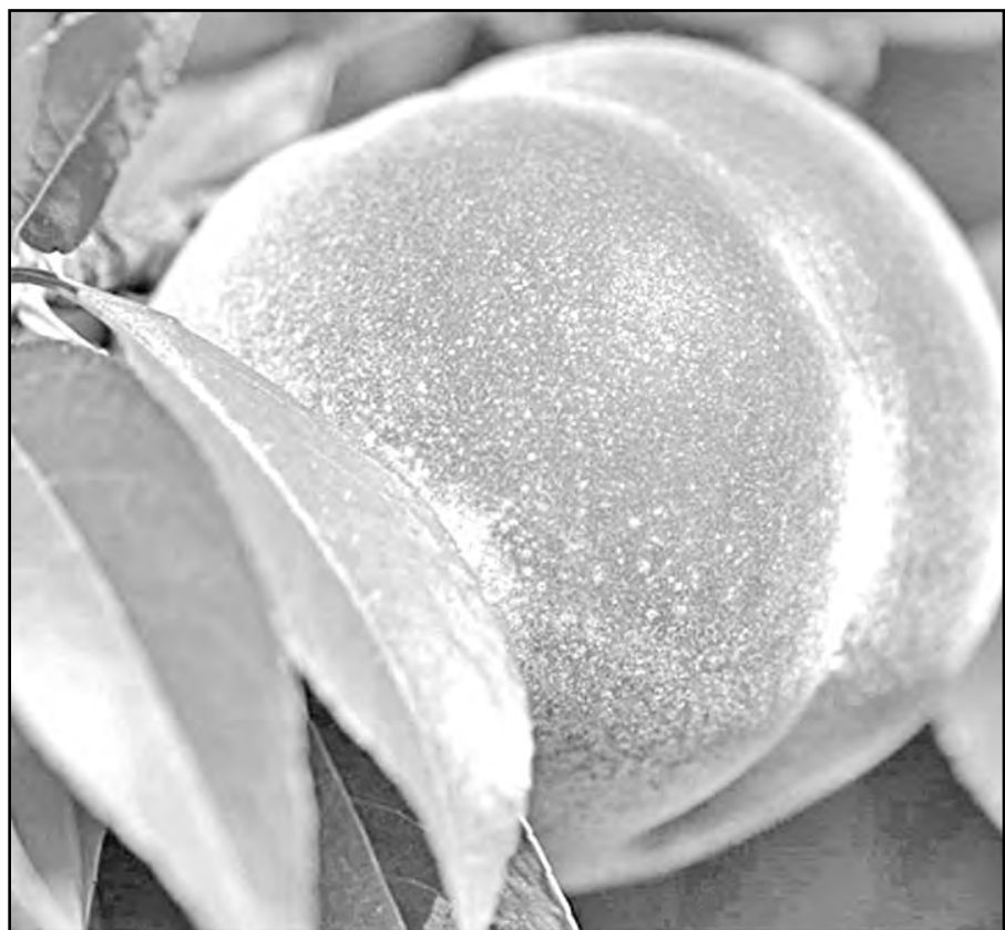
A series of freezes in April caused damage to the commonwealth's fruit crop, but growers are nevertheless reporting another delicious crop will be available this summer.