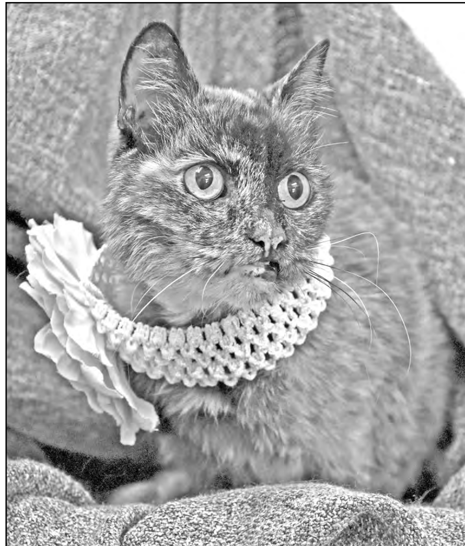
Meet Huckleberry. She became a resident at the Animal Care and Adoption Center after she was found roaming on a local trail. She is as sweet as her name might indicate. Huckleberry loves attention and affection from her favorite people and prefers a home where she is the only pet.