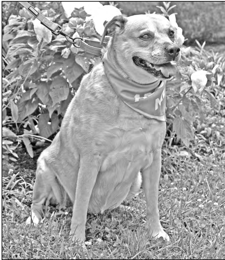
Rosie would love to find her forever home. She is an older gal who prefers hanging out on a comfy couch, though she does well walking on a leash and would benefit from some exercise. Rosie's adoption is sponsored by Montgomery County Friends of Animal Care and Control.