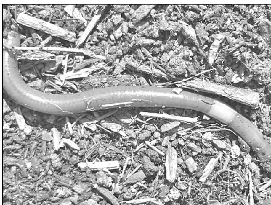
Invasive jumping worms are becoming widespread across Virginia, including Montgomery County. They feed on leaf litter, thus increasing the chances of soil erosion and depriving animals that feed on the litter of a valuable source of food.

"It's almost certain that some of these worms have been spread by people using them for fish bait too," Dellinger noted. "And people buying worms online