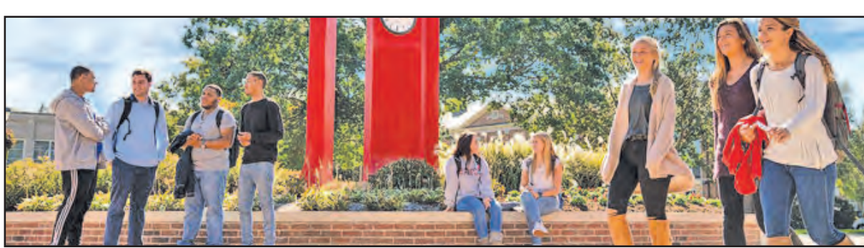
Radford University's College of Distinction designation shows that it is one of the commonwealth's best colleges.