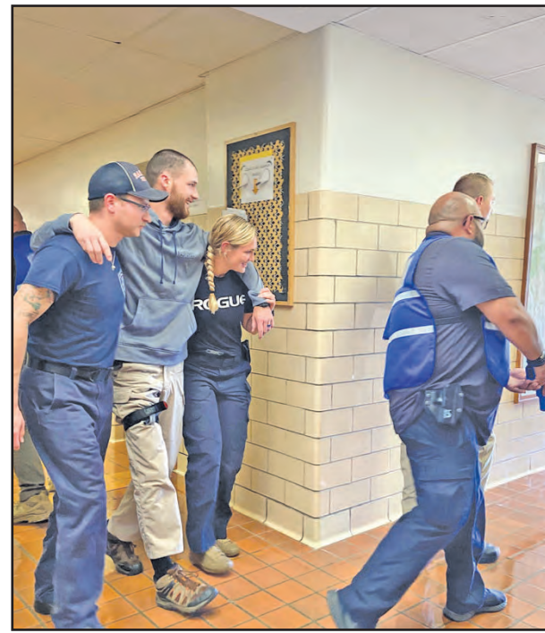
In July, Radford City Police participated in an active threat training course designed to increase the survivability of victims injured during an active threat situation.