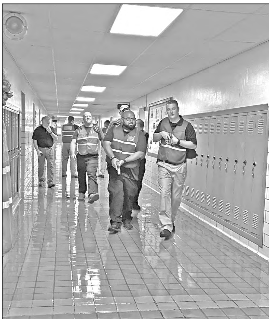
An active threat training session in July was attended by members of Radford City Public Schools and Radford public safety officials, including the Radford City Police Department, the Radford Sheriff's Department, and Radford University emergency management officials.

"This allows our agency to be better prepared to protect and serve our community daily should an active threat incident arrive,"