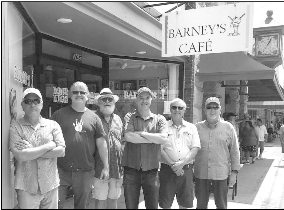
Influenced by Bill Monroe and the Stanley Brothers, the Java Brothers will offer bluegrass music that is a mix of standard bluegrass and newgrass at the free NRCC concert on Saturday, Nov. 12.