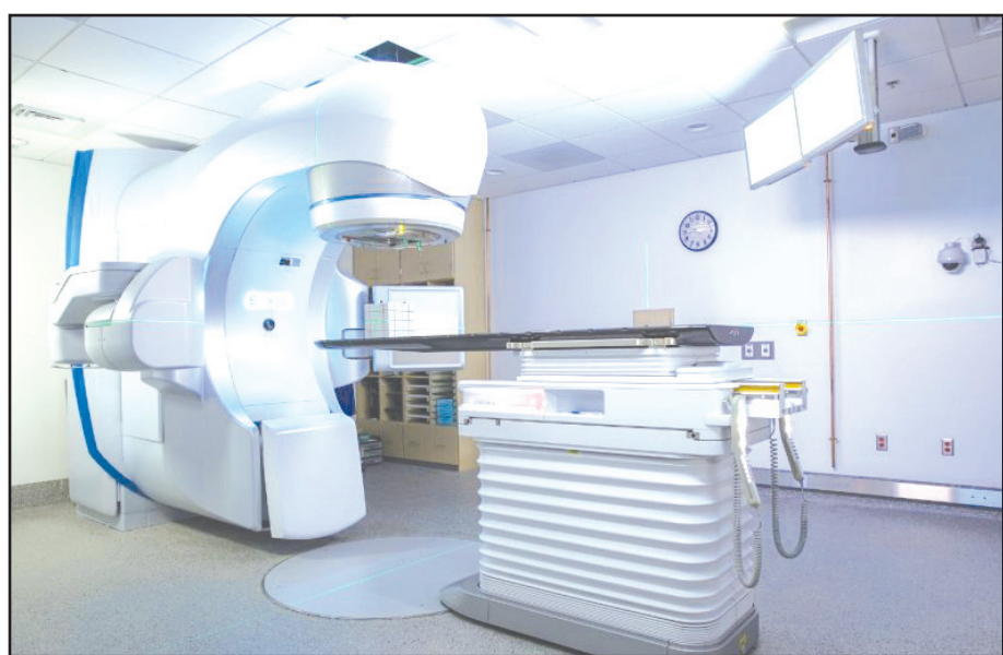
The $3.28 million linear accelerator positions the Animal Cancer Care and Research Center as the region's only radiation oncology service for pets.

The linchpin of future facility plans is the college's proposed approximately 42,000-gross-square-foot addition and renovation for its Veterinary Teaching Hospital in Blacksburg. The need exists because of a doubling of students and