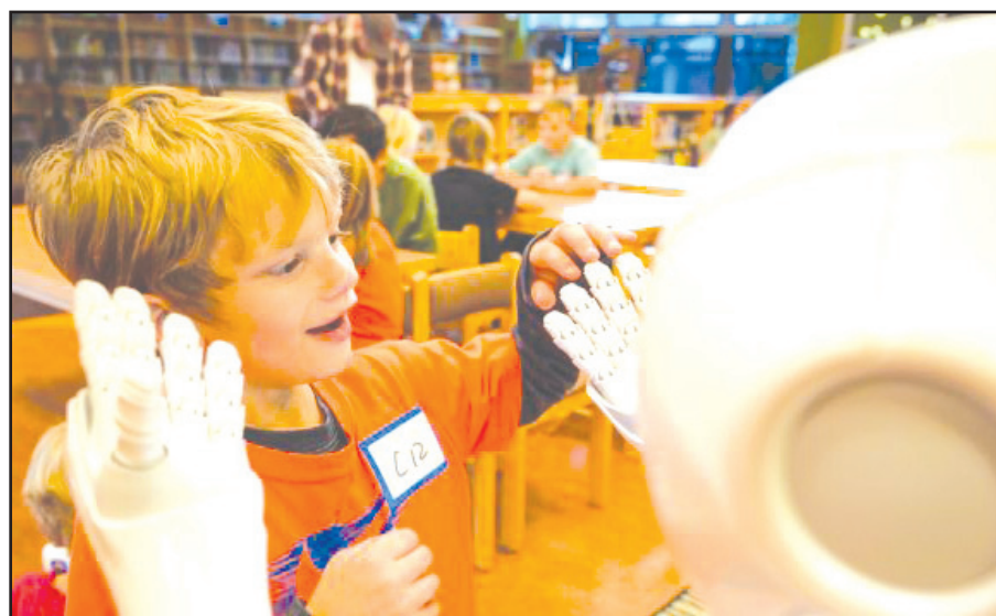
A student at Eastern Montgomery Elementary School talks to Pepper, the robot, during an after-school robot theater program led by Virginia Tech researchers.