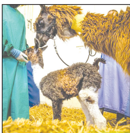
A female llama, named Jewel of the Nile, and her daughter cria, Cairo, get care at the Virginia-Maryland College of Veterinary Medicine after the successful emergency C-section.

But none of those things did go wrong when personnel at the Veterinary Teaching Hospital faced just such an emergency in