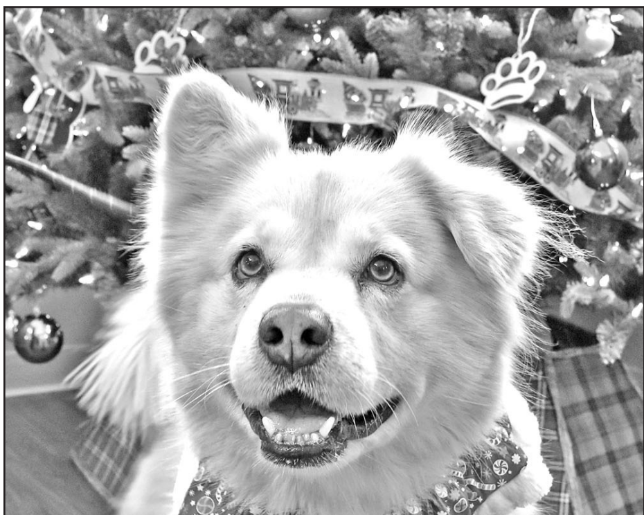
Tebow is a friendly boy who needs a home where he would be the only pet. This fluffy ball would do well with children over the age of four. He knows a few commands and will gladly sit for a delicious treat.

SUBMITTED BY MONTGOMERY COUNTY ANIMAL CARE AND ADOPTION CENTER