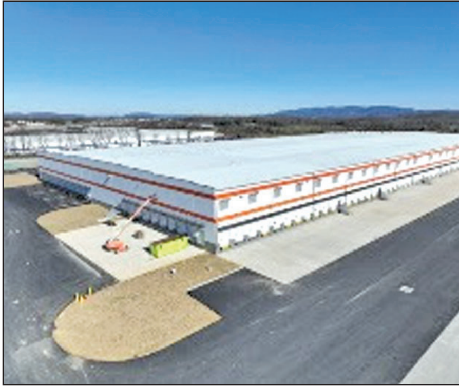
A 251,000-square-foot FedEx distribution center located on 41 acres in Montgomery County's Falling Branch Corporate Park is expected to be operational in 2023.