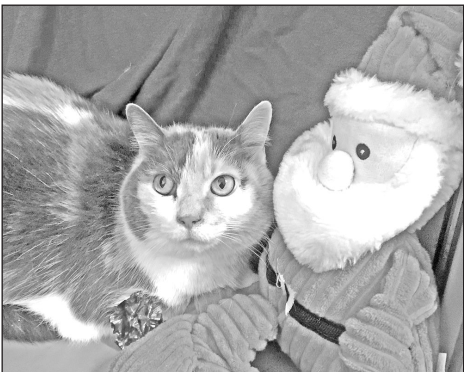
Primrose's holiday wish is to be whisked away into a forever home! She recently returned to the Animal Care and Adoption Center after some time in a foster home. Her fosterers say that Primrose loves snuggles and affection and would be happy enjoying a Greenie treat.