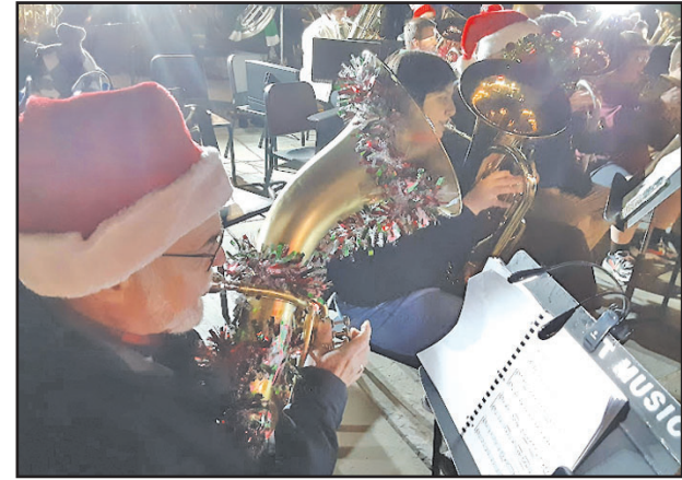
A number of players contributed to the lighthearted, holiday spirit of the evening by wearing elf hats throughout the performance.