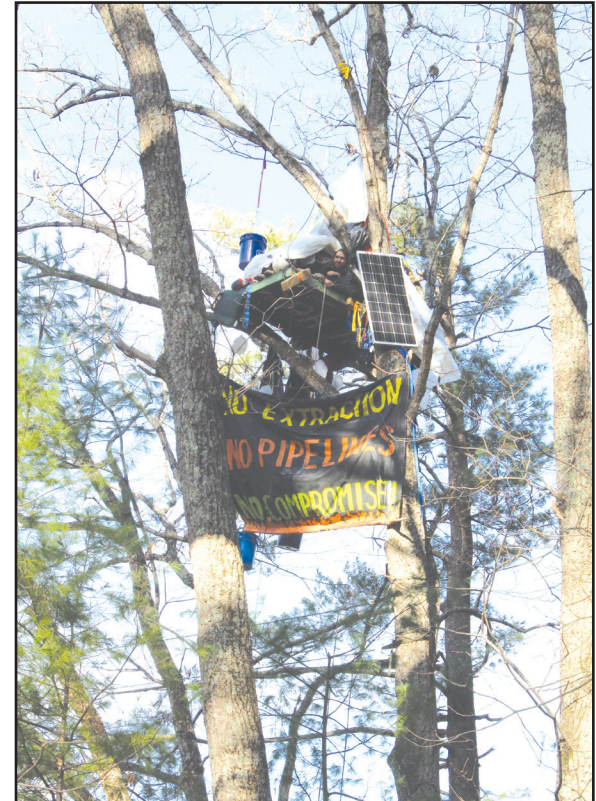
Just over a year ago tree sitters were removed from sites near Yellow Finch Road in Elliston, which had been one of the last places protesters had been able to block work on the Mountain Valley Pipeline.