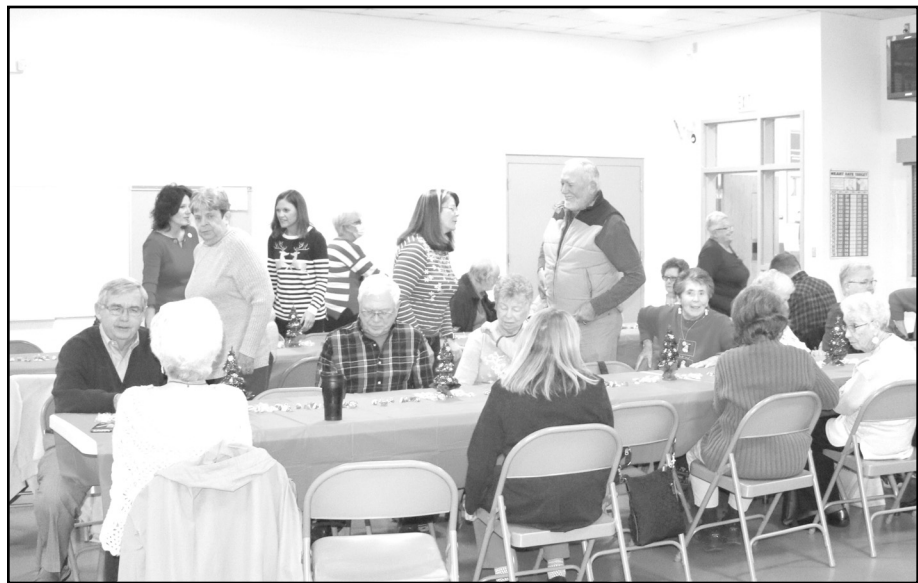
RSVP volunteers and community partners gather to fill their plates with holiday goodies.