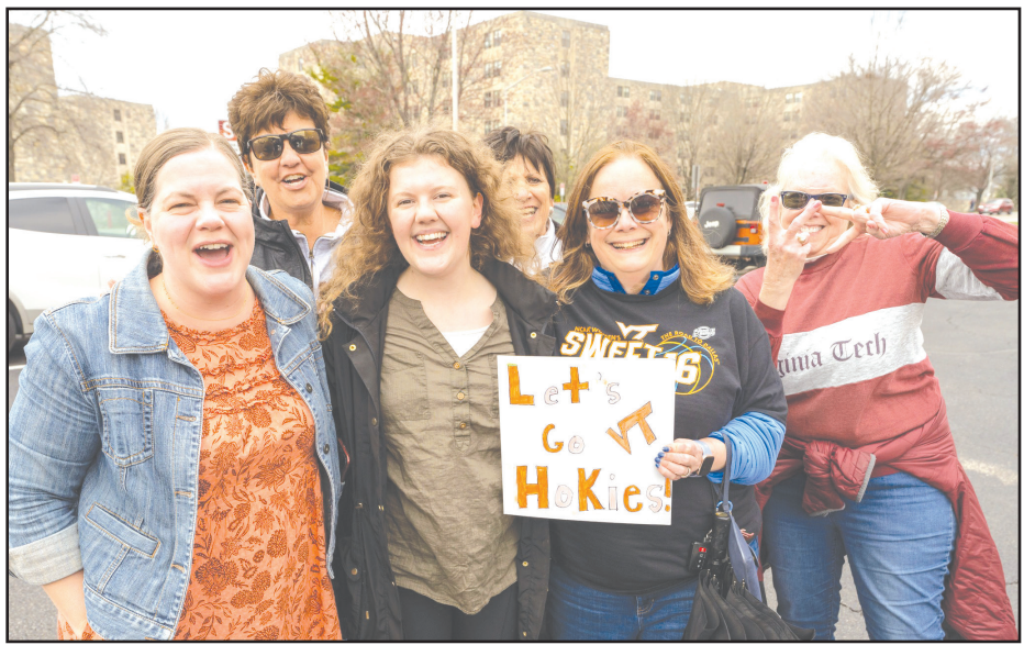
Fans gave the Lady Hokies a grand send off Wednesday as they left for their the Sweet 16 in Seattle.

The Buckeyes needed a buzzer-beater to defeat North Carolina on Monday to claim their second-straight trip to the Sweet 16. Ohio State is in the midst of its 25th NCAA Tournament appearance and is pursuing just its second Final Four in program history.