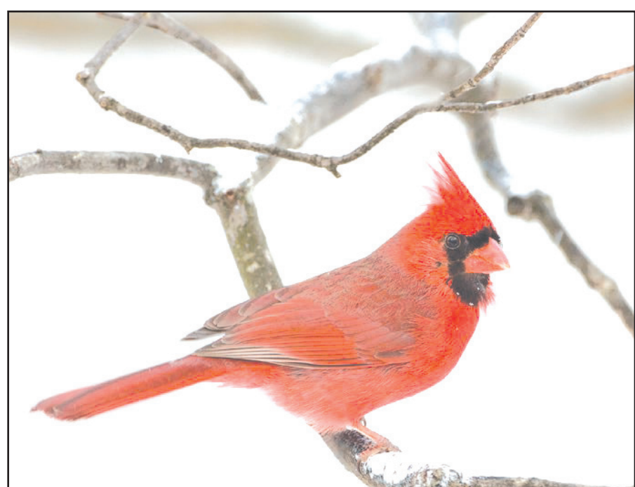
An image of a male cardinal on a snowy branch.