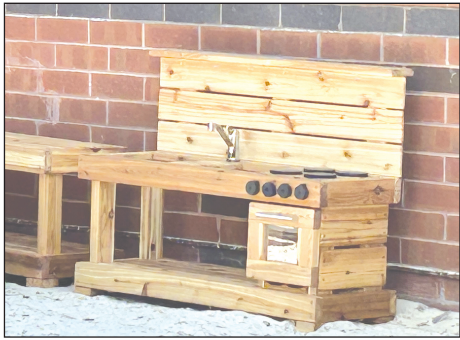
The Kiwanis Club also donated money for this new mud kitchen on the playground.