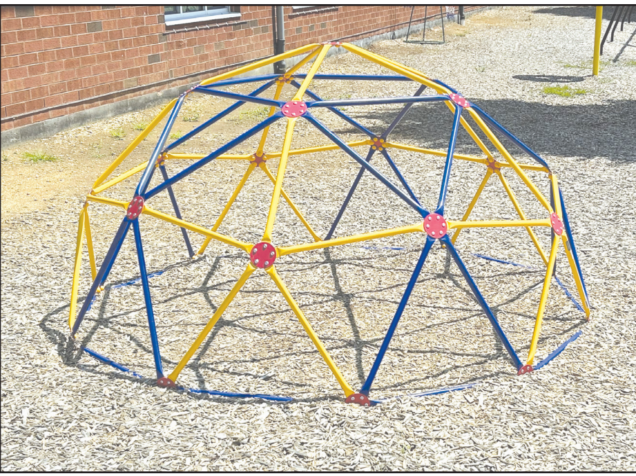
A new climbing dome is in place at Prices Fork Elementary School