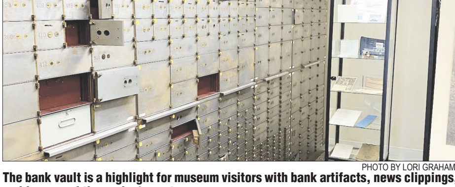
The bank vault is a highlight for museum visitors with bank artifacts, news clippings, and images of the region's past.