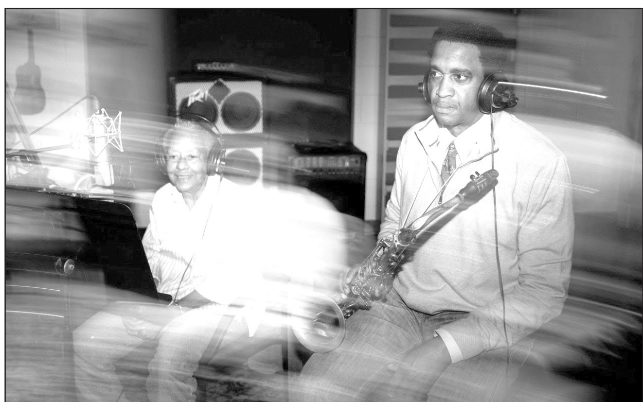
Nikki Giovanni (at left) and Javon Jackson collaborate in the studio.

from Virginia Tech’s Department of English last year after a 35-year tenure and recently made headlines with the development of a documentary about her life and career. “Going to Mars: The Nikki Giovanni Project,” was acquired by HBO Films after winning the Grand Jury Prize for U.S. Documentary at the 2023 Sundance Film Festival earlier this year. For the Moss performance, Giovanni will share some of her poetry and make a rare vocal appearance on the tender ballad “Night Song,” singing a song identified with her close friend, the late singer, songwriter, and civil rights activist Nina Simone.