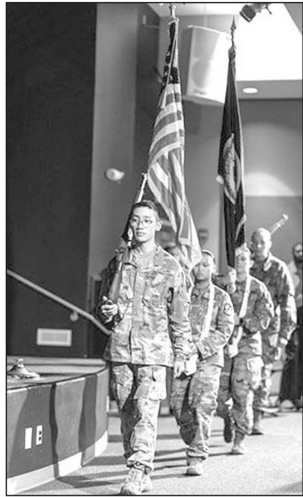
U.S. Army ROTC cadets conduct the posting of the colors at Radford University's ceremony to recognize Veterans Day 2022. The event took place at the Hurlburt Student Center Auditorium.