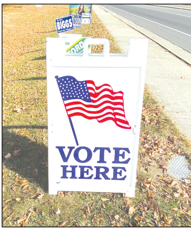
Candidate's campaign signs line streets at various polling locations throughout Montgomery County on Tuesday.