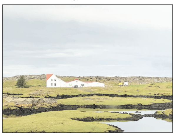
“Icelandic Thaw,” a photograph by Susan Lockwood

Chan, of Blacksburg, learned how to paint with Chinese brushes when