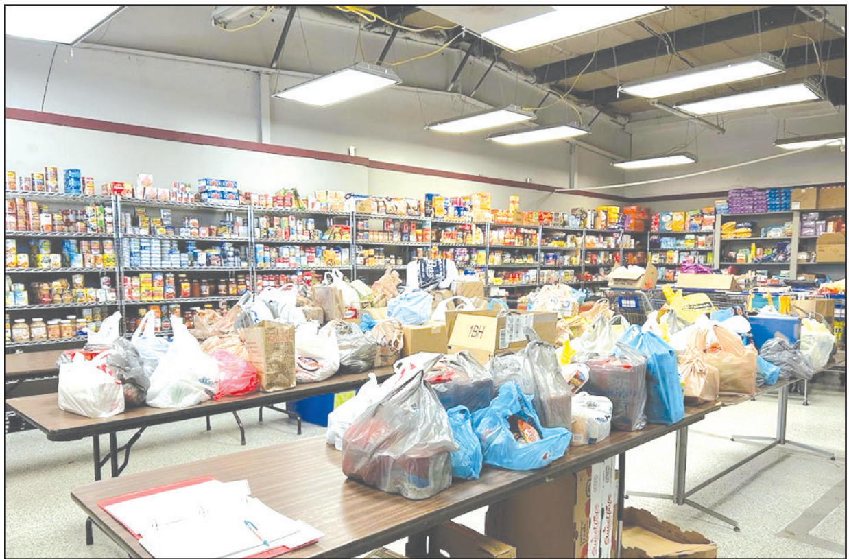
The Montgomery County Emergency Assistance Program's Food Pantry provides food assistance, as well as clothing and other donations, to community members in need.