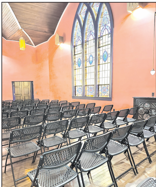
Great Roads on Main provides a breathtaking scene of stained-glass windows, arched entryways, and cathedral ceilings.

building is now up for sale with Long and Foster listing the commercial property at $2.5 million. There are three buildings in all that include a coffee shop, restaurant, and multiple suites that are currently leased commercially, according to www.longandfoster.com.