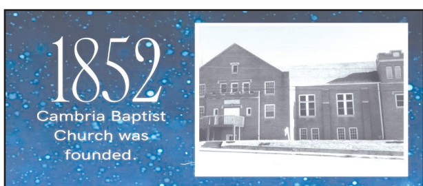
Cambria Baptist Church building, now known as Great Roads on Main, was originally founded in 1852, changing names and ownership over the years.