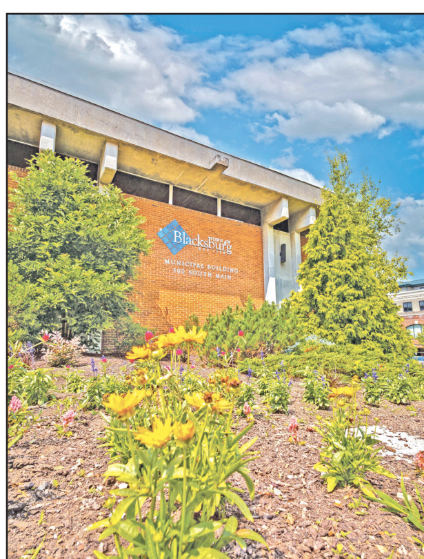
Blacksburg Municipal Building

Among consent agenda items unanimously approved by Council, Ordinance 2038 to amend Town Code sections 14-