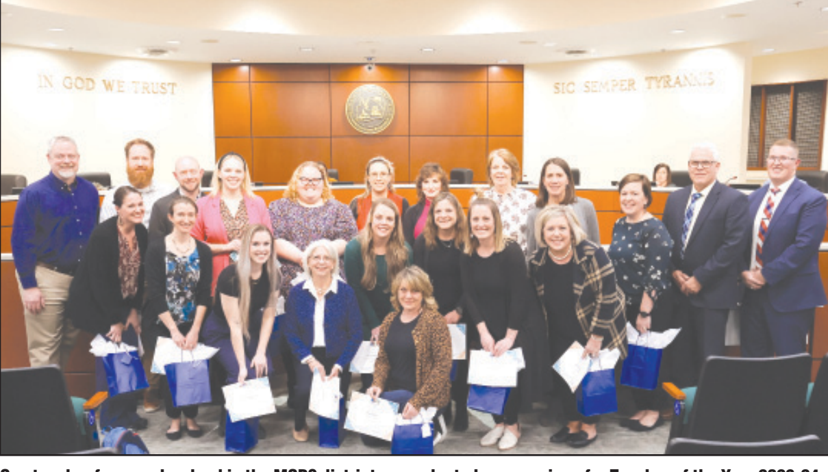
One teacher from each school in the MCPS district was selected as a nominee for Teacher of the Year 2023-24.