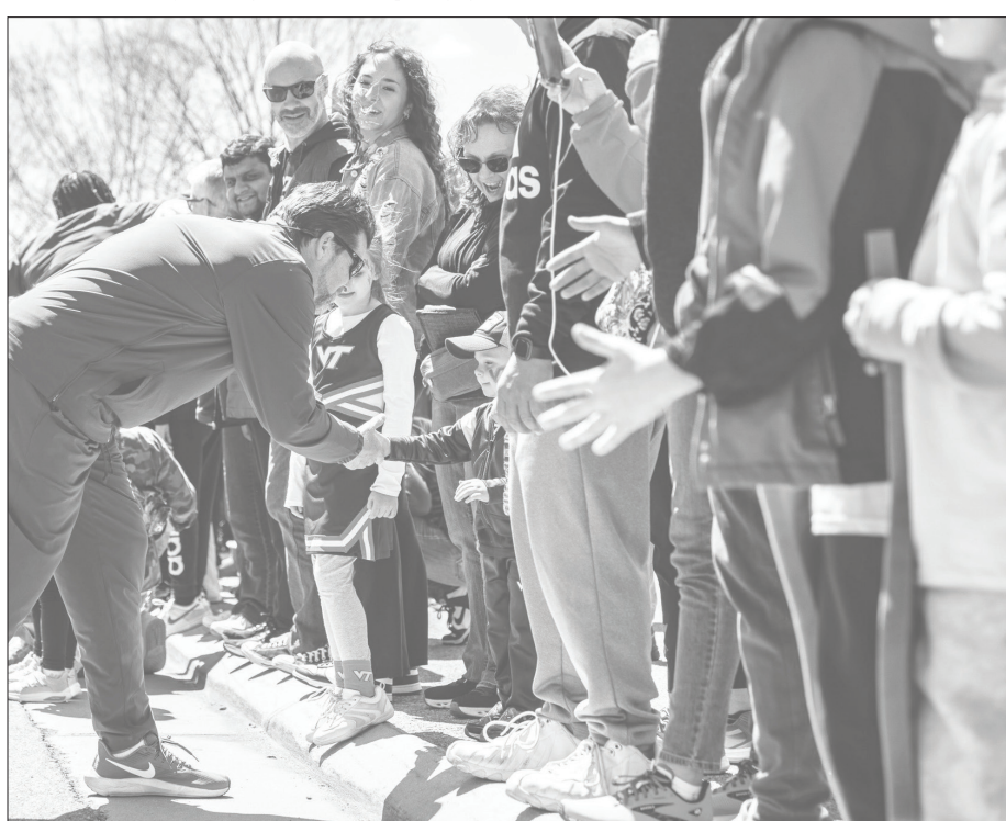
Virginia Tech coaches and players shook a lot of hands Saturday during the pre-game walk into the stadium.