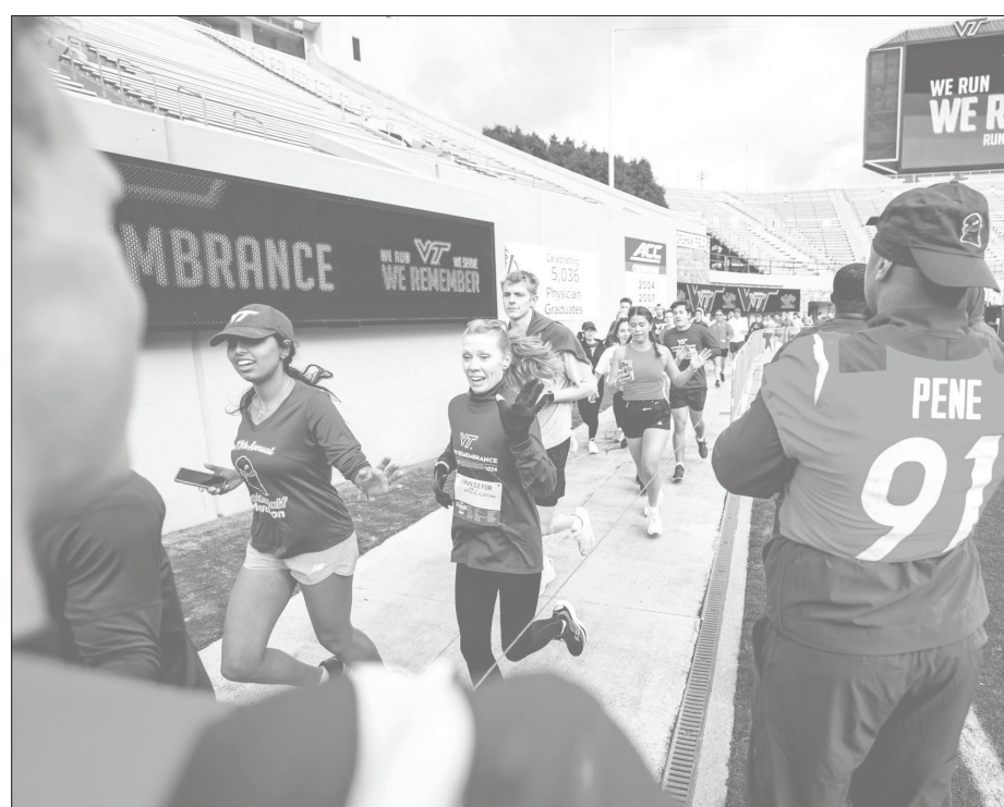
Players took time out of their busy day to greet runners as they entered the stadium Saturday during the Run of Remembrance.