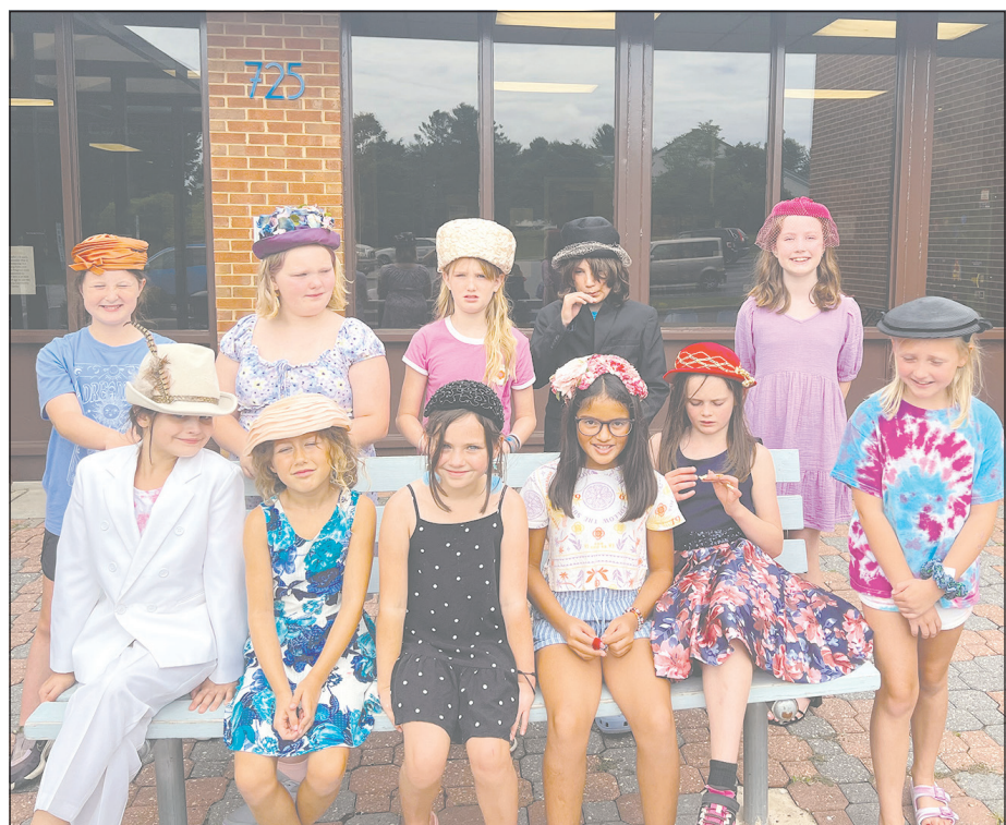
Campers show off their hats for the camp’s etiquette hat tea party.