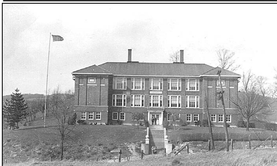
An early 1940's image of the old Shinnston High School at the top of Pike Street.

Memorable Photographs from around Harrison County.