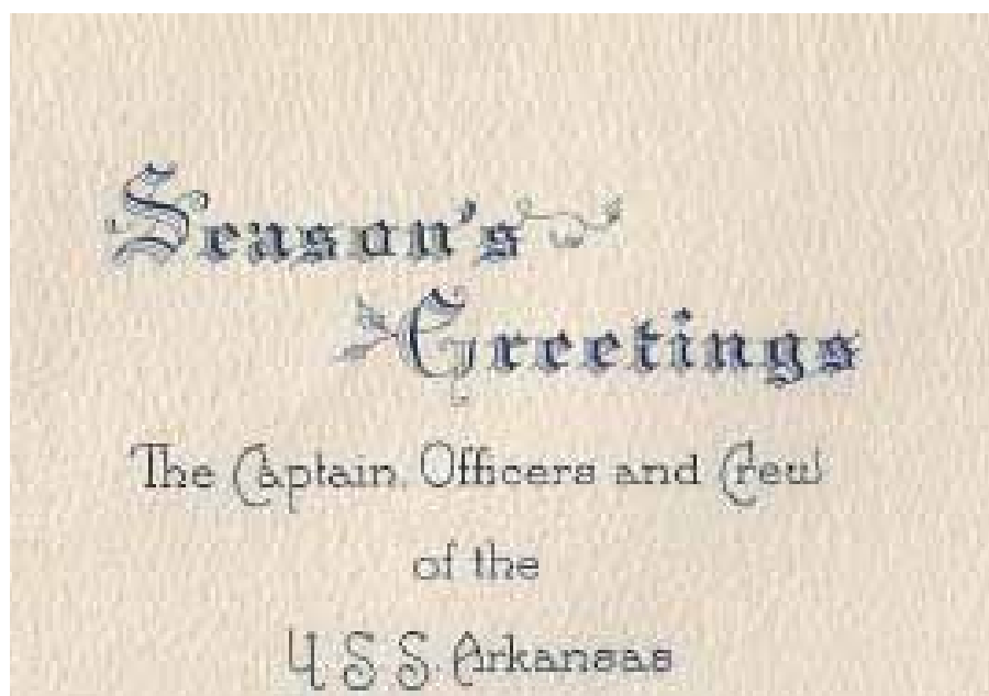
World War II Christmas card from the USS Arkansas.

Memorable Photographs from around Harrison County.