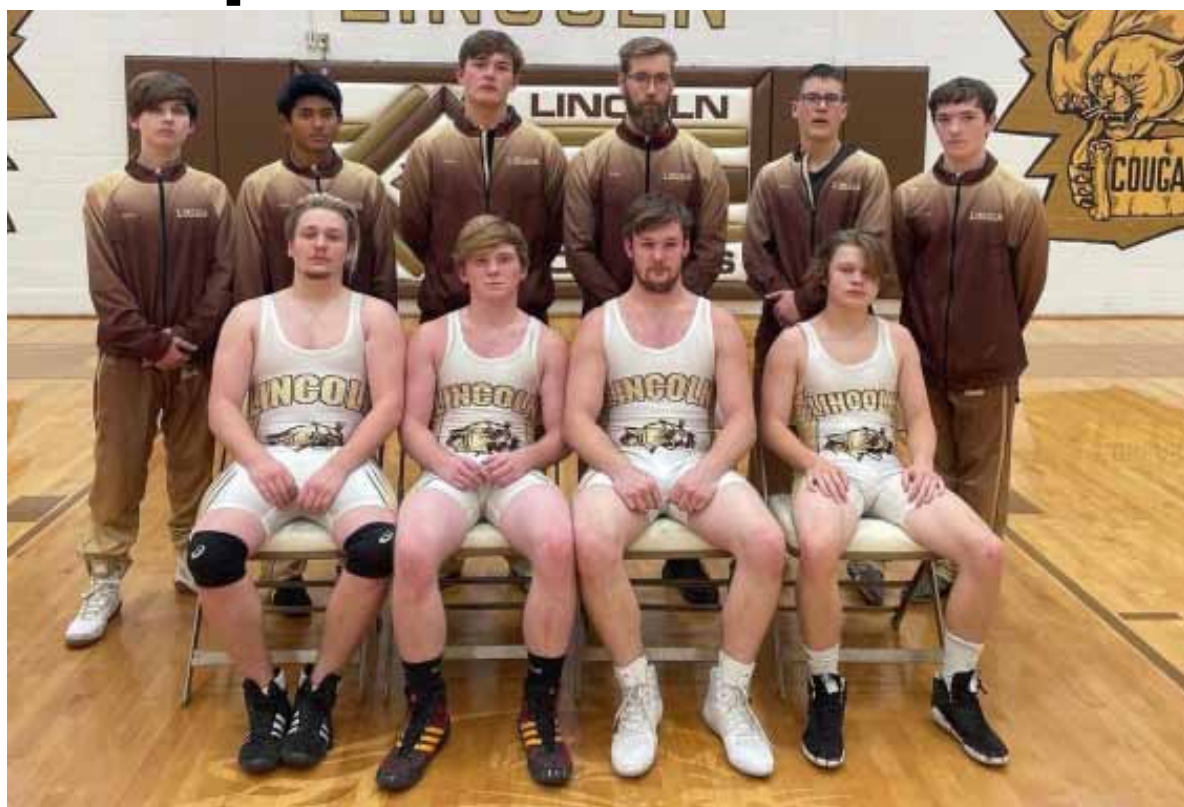
Winter sports is back at Lincoln. Pictured is Lincoln High School’s 2021 Wrestling Team which opened its season last week with a trip to Buckhannon Upshur.