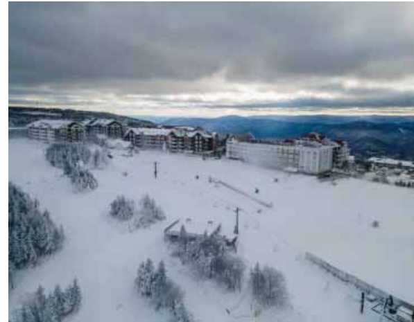
Snowshoe Resort opened a limited amount of slopes to skiers on Thanksgiving Day..

organizers at Snow Shoe have been working hard replacing water lines and airlines underground updating the snow making system. They have been running snow canons across the mountains since November. Snow making is a year-round job.