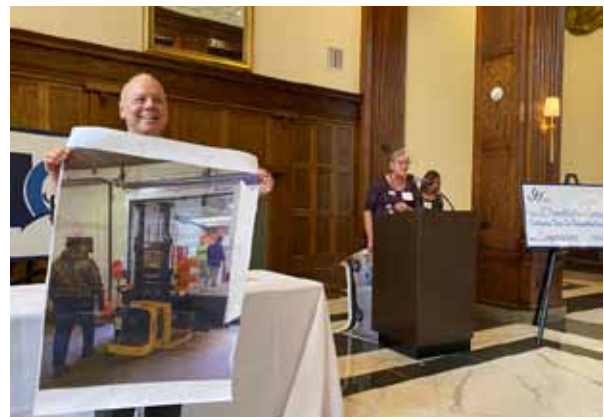
On Nov. 12, Harrison County Senior Center received a $5000 Your Community Foundation grant towards the purchase of a box truck for the senior nutrition program and other center needs.