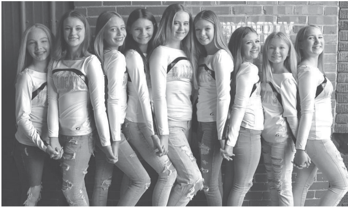
The Lincoln Middle School Wildcats won the county championship on Jan. 29.

She was also encouraged when she looked up into the stands Saturday and saw several students showing great potential. She feels confident that now that the girls have won the county championship, “these girls are going to want it again!”