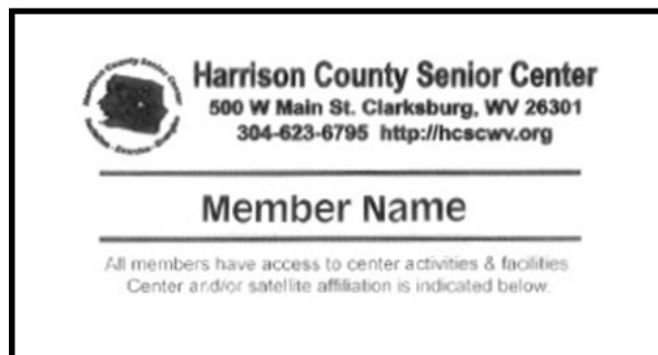
A sample of the front of the new cards is shown.

contact your satellite president to obtain your card. Members without a satellite affiliation, please contact the center at 304-623-6795 to request printing of your card and advise them when you will come to the center to pay your $10 dues and pick up your card. Dues will be collected yearly to maintain a valid card.