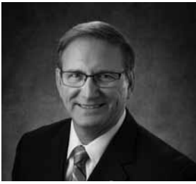
State Senator Ron Stollings, MD

Of all the policy proposals included in the federal reconciliation bill, prescription drug pricing reform cut through the noise as a bright spot for bipartisan agreement — and for good reason. For far too long, pharmaceutical companies have used shady tactics to hike their prices while everyday Americans are