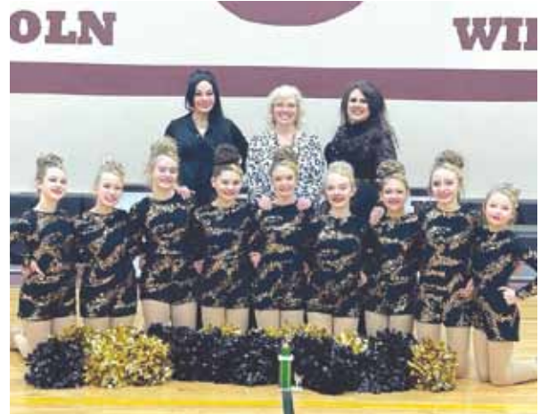
Jan. 29 marked the first time the Lincoln Middle School Wildcats danceline won the county championship.