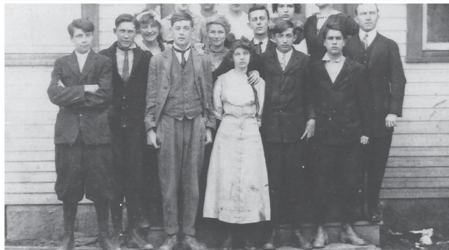
A group of 1915 Wyatt High School students.

Memorable Photographs from around Harrison County.