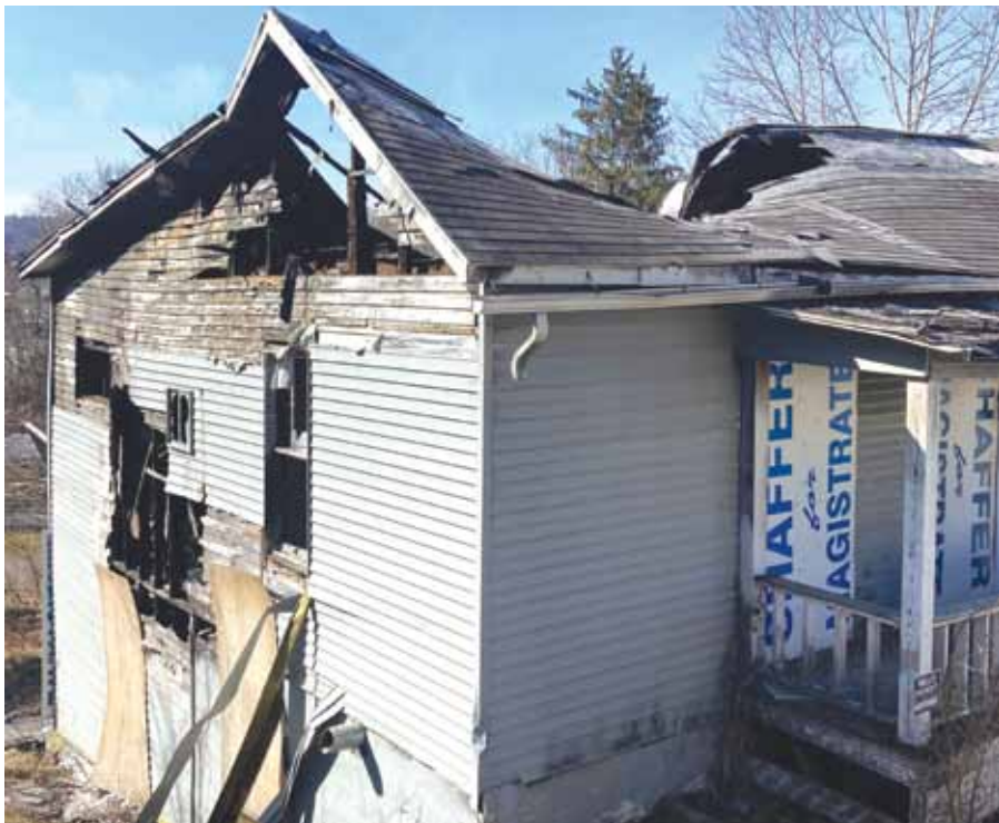
Shinnston city officials plan to sue over an abandoned, neglected home on Charles Street. NAJ, LLC, the company that owns it, has not responded to their complaints.