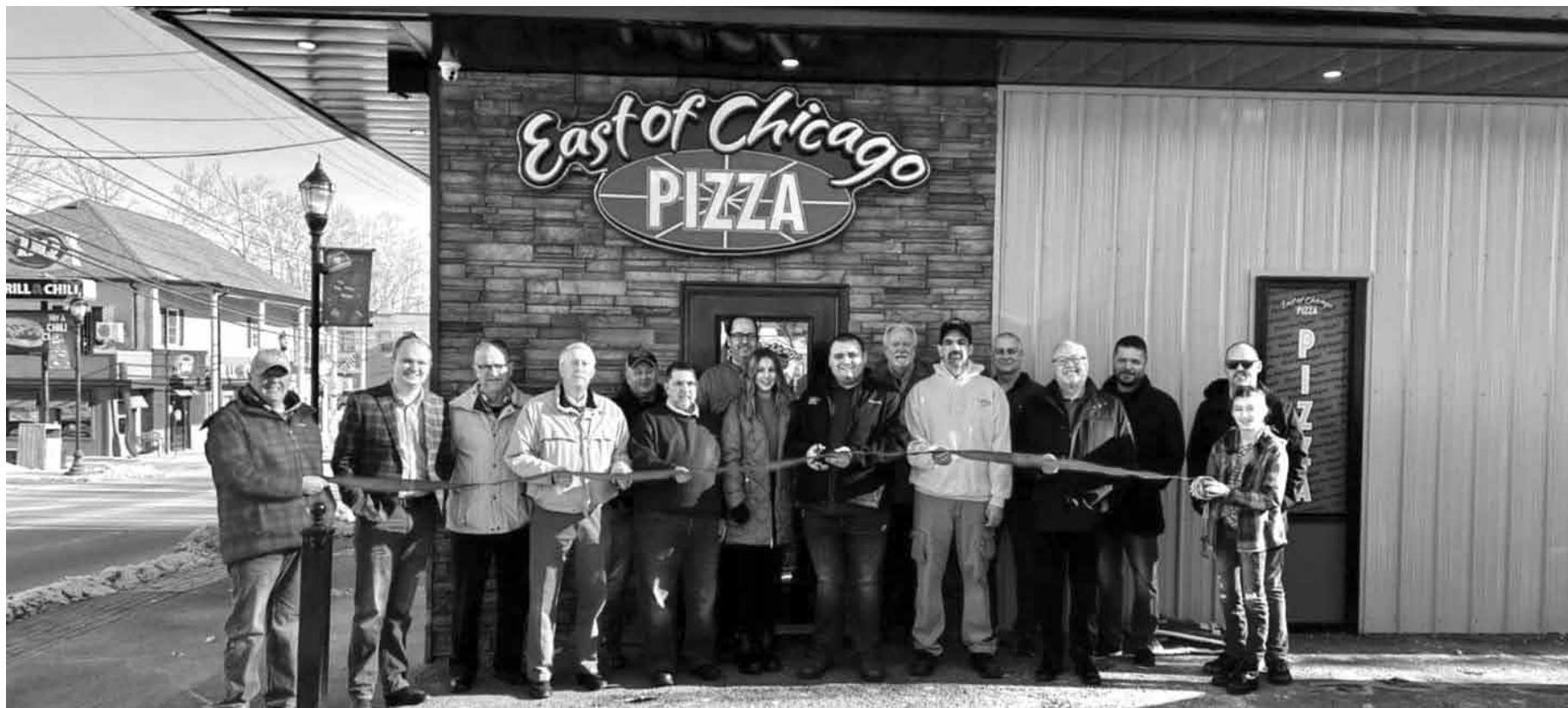
East of Chicago Bridgeport held a ribbon cutting on Jan. 22.

"Do not let negative comments get you down, learn from them and do better the next time. People are going to tell you 'That will never work' but you must learn that for yourself...trust your instinct," he said.