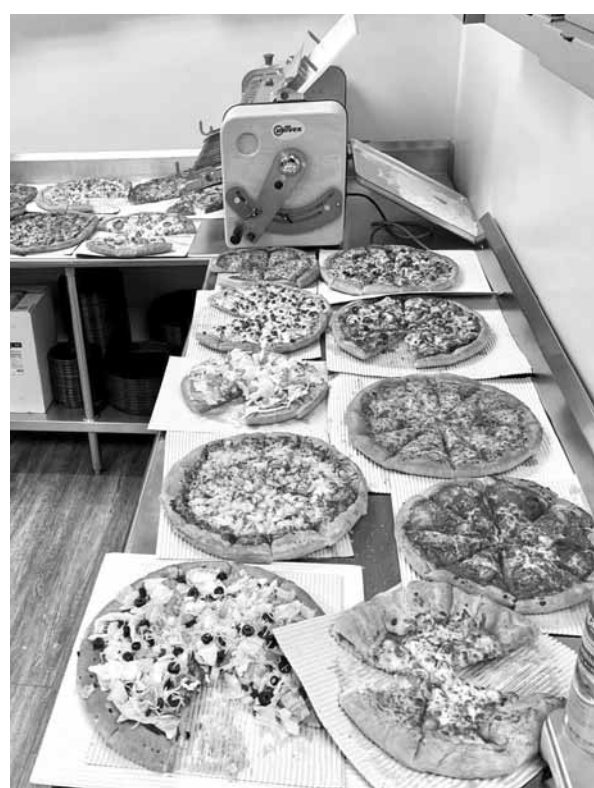
East of Chicago Pizza held a training day and taste test day for the new employees at East of Chicago Bridgeport on Jan. 19.