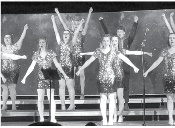
South Harrison High School show choir performs "Stars" at South Harrison High School at a show choir competition on Feb. 12.