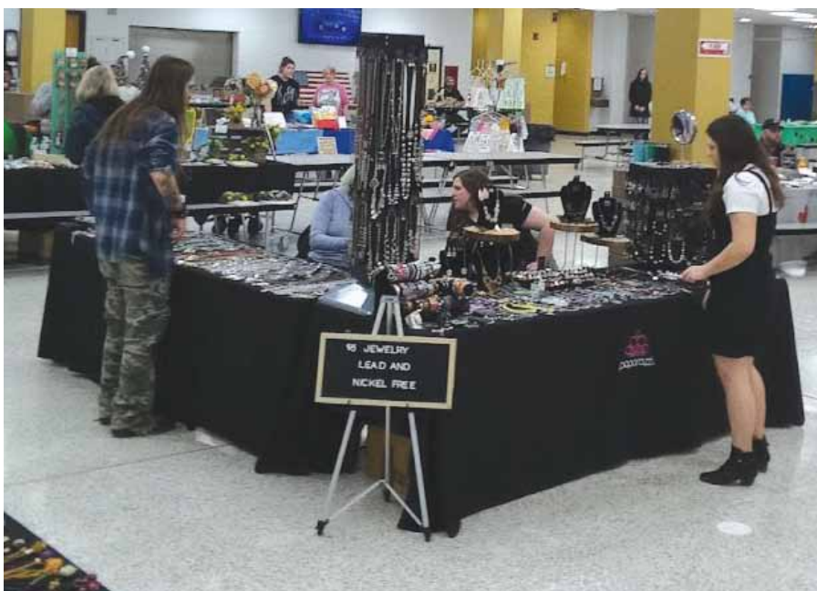
Lincoln High School Key Club put on a craft show on Feb. 26 and raised more than $850 for a teacher with cancer.