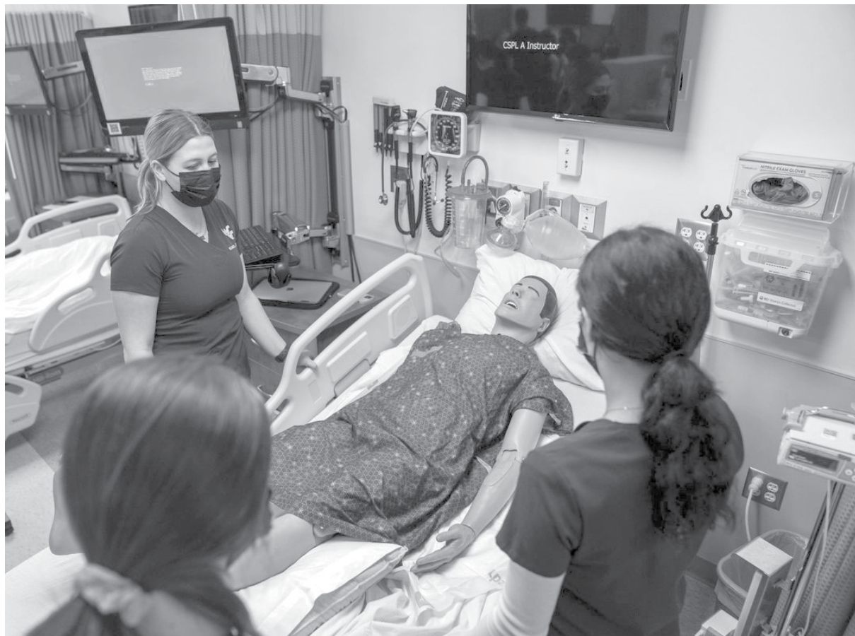
West Virginia University and United Hospital Center are offering an 18-month nursing program at the Bridgeport hospital campus for people who already have bachelor's degrees in other fields.