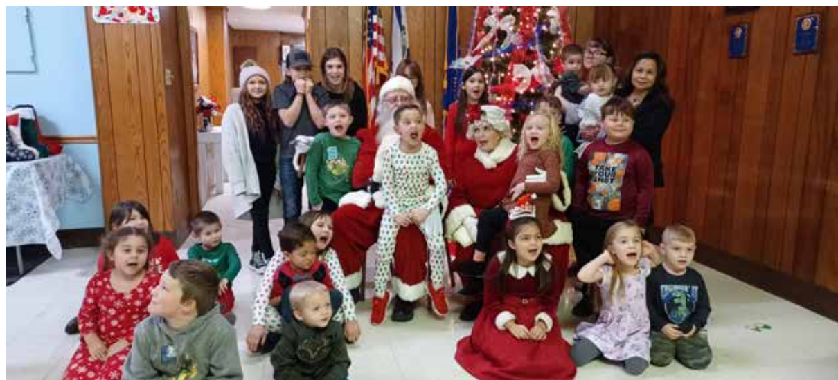
Santa and Mrs. Claus enjoy the day with some of the children attending the annual American Legion Post 31 and American Legion Family (Auxiliary, Sons, and Riders) annual Children’s Christmas Party.