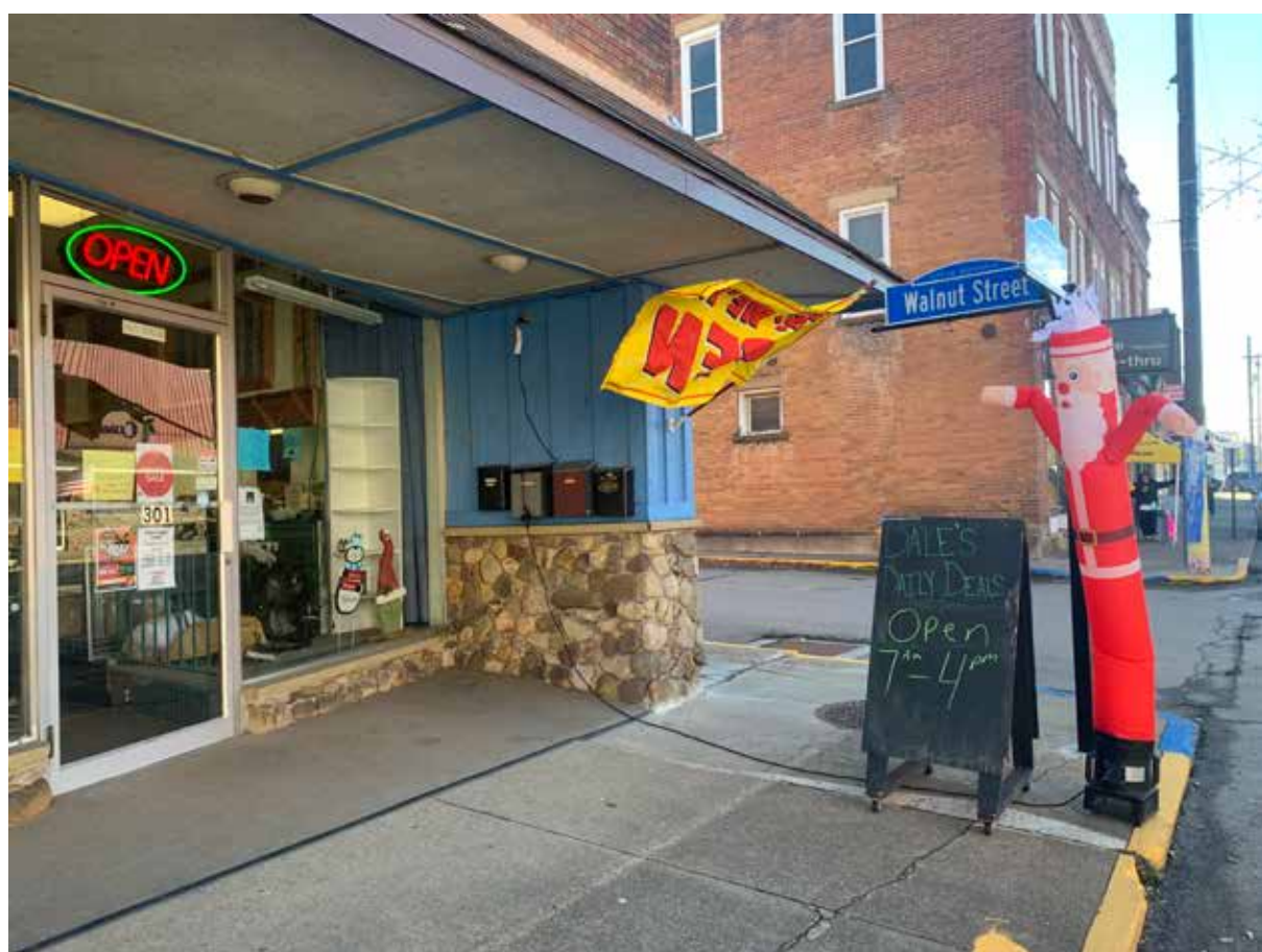
Several shoppers reported that Dale's Daily Deals, at 301 Pike St. in Shinnston, had the best deals in town during the holiday shopping season.

Store hours for Dale's are currently 4 p.m. - 8 p.m. Tuesday and Thursday, 9 a.m. - 5 p.m. Friday, and 9 a.m. - 4 p.m. Saturday.