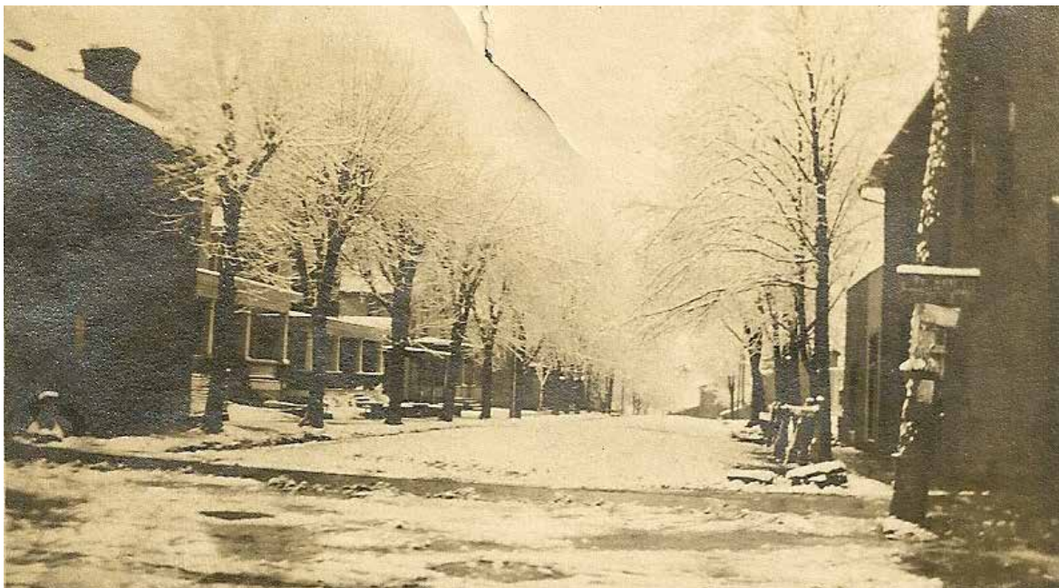
Looking down the western half of Main Street one winter morning in the early 1920s.

Memorable photographs from around Harrison County