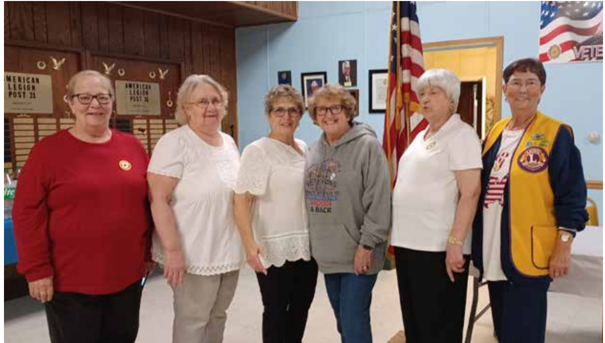
The Shinnston Lions Club and American Legion Post 31 and the American Legion Family held a Veterans Day luncheon on Nov. 11.

“I always tell people if they need to talk to somebody, you’ve got my phone number, you can give me a call anytime,” she said. “A lot of people have.”