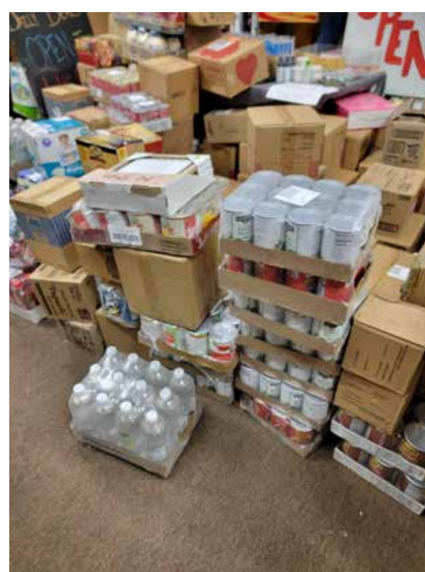
Dale's Daily Deals, which recently celebrated its third anniversary, recently received a large amount of grocery items to sell at a discount. Since they make their pallet purchases unsure what's inside, inventory changes quickly.