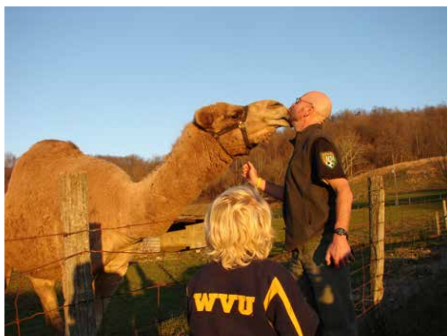
A guest at the Gillum House in 2014 kisses a camel; feeding a camel a "carrot" instead of giving a gift of "carats" is part of the bed and breakfast's Valentine's Day month special.