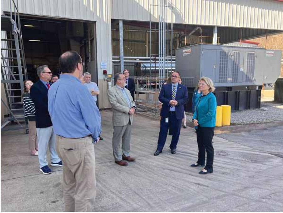
U.S. Senator Shelley Moore Capito (R-W.Va.) visits STOCKMEIER Urethanes USA, Inc. in Clarksburg on Thursday, February 23.

U.S. Senator Shelley Moore Capito (R-W.Va.), a leader on the Senate Appropriations Committee, made several stops in Harrison County on Thursday of last week focused on economic development and Congressionally Directed Spending (CDS) projects. First, Senator Capito visited the Kelly Miller Community Center where she toured the facility and met with the center’s leadership and local leaders, according to a news release. “As a leader on the Appropriations Committee, I have made sure West Virginia’s needs are front and center when our nation’s funding decisions are determined. The Kelly Miller Community Center is a perfect example, and I was proud to help them secure a CDS request earlier this year that will directly impact their facility—and ultimately the surrounding community,” Senator Capito said. Next, Senator Capito visited