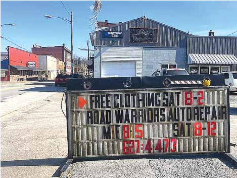
Road Warriors Auto Repair’s goal is to give back to the community. One way is by participating in a free clothing giveaway for locals.

changes, diagnostics, and suspension repairs, and he is hoping to include inspections sometime in the next month. Even though Road Warriors has only been open for a few weeks, he says that business is doing well and slowly picking up over time. “(We) had a lot of good response from the community. People are just thankful to have a garage right here in town. I believe it will do well.” Ashley Dytzel, who purchased the building for Road Warriors along with her husband Jeff Dytzel, said they were extremely grateful for all the love they had received from locals. The ribbon cutting Feb. 13 was met with success, and she is thankful for businesses such as Minor’s Auto and NAPA that have given them connections and support. She agrees with Owens that the local response is confirmation that they are where they