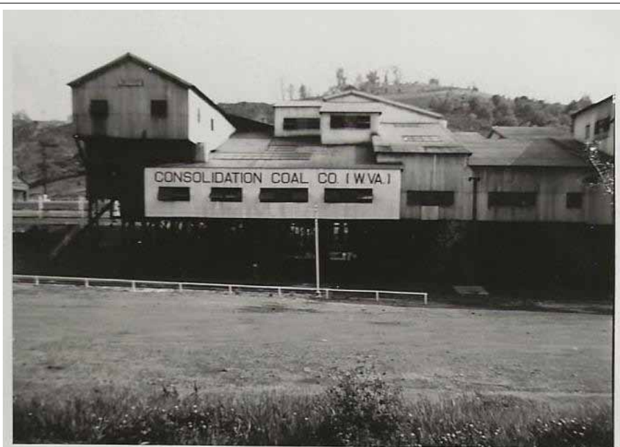
1940s photo of the old Prep Plant at the Owings Mine.

The programs and activities offered by the WVU Extension Service are available to all persons without regard to race, color, sex, disability, religion, age, veteran status, political beliefs, sexual orientation, national origin, and marital or family status. When registering for these programs, please designate special access or dietary needs three weeks prior. The information given herein is supplied with the understanding that no discrimination is intended and no endorsement by the Cooperative Extension Service is implied.