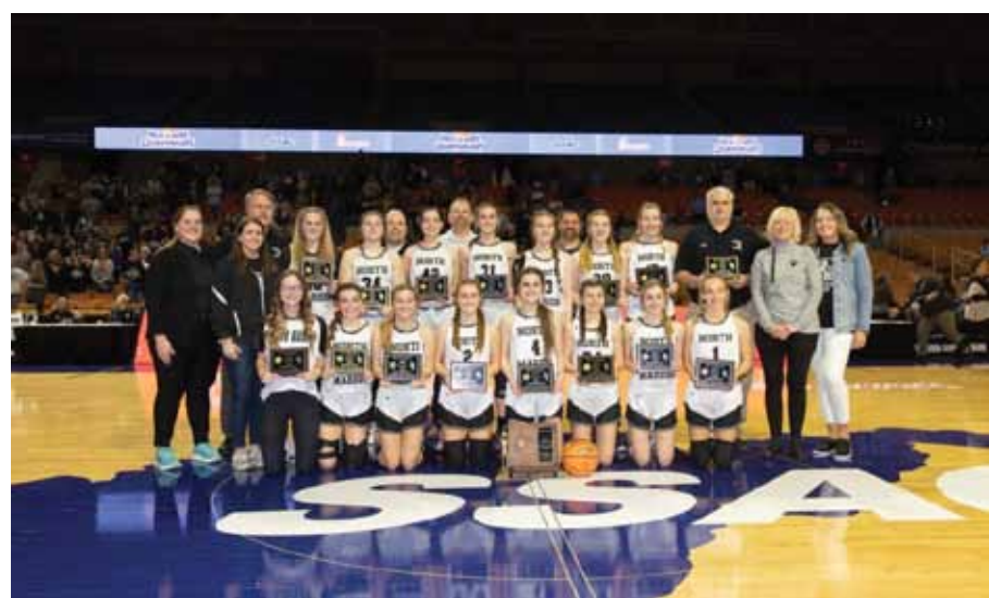
North Marion defeated Philip Barbour Saturday for the WVSSAC Class AAA Girls Basketball Title.