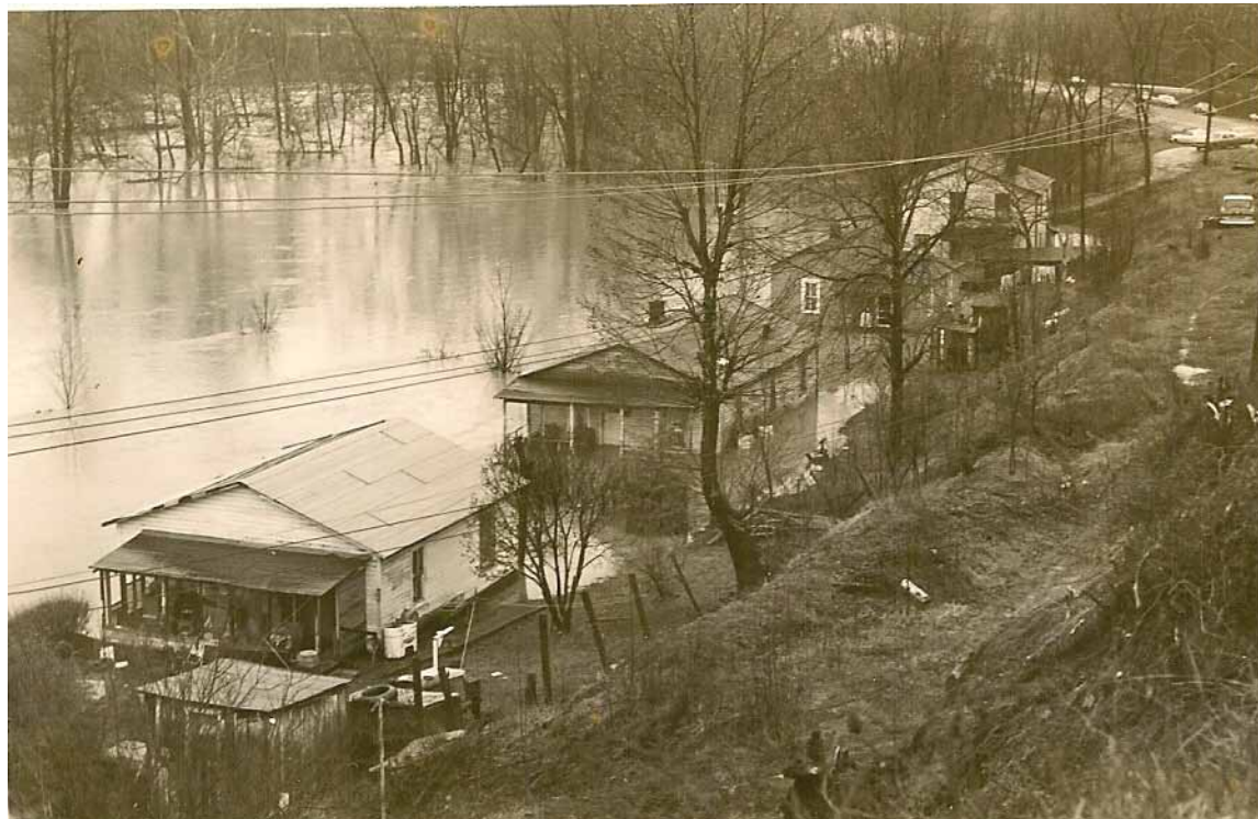
Shown is a 1960s flood scene at Spelter.

Memorable photographs from around Harrison County