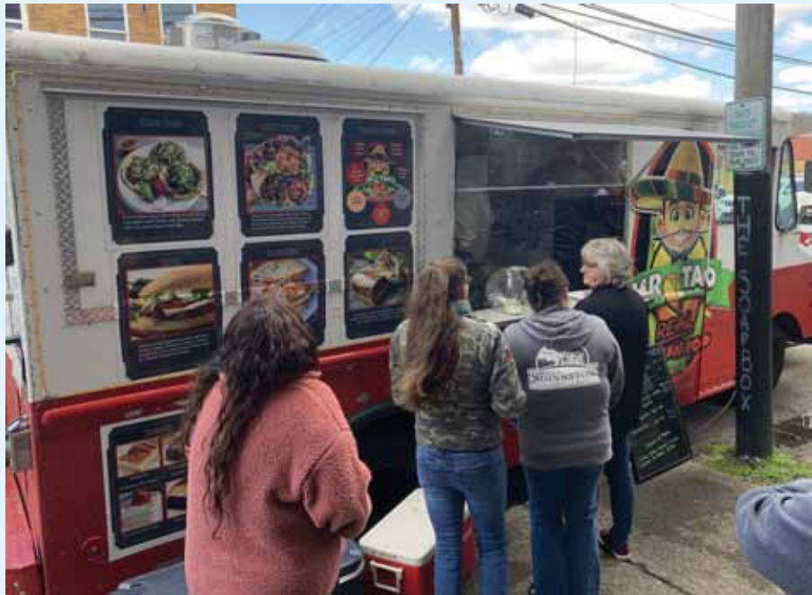
Lines form during the noon lunch hour for Taco Truck Tuesday, which kicked off last week on March 7. Business was steady.