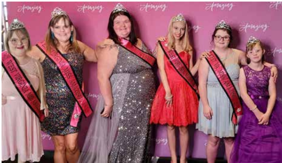
The West Virginia Miss Amazing contest, now in its third year, celebrates girls and women with disabilities