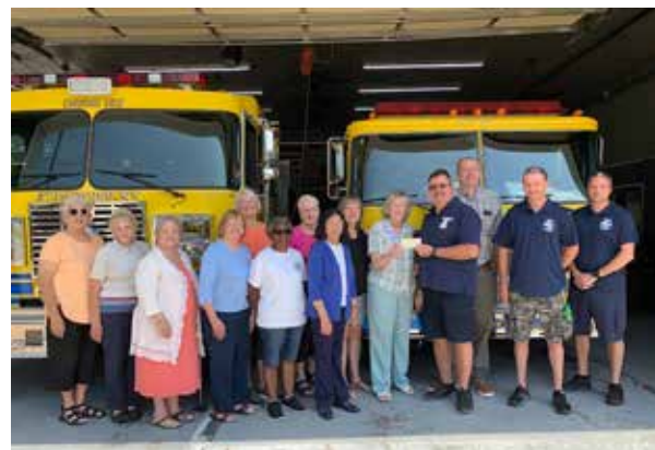
The Stonewood CEOS Club made a donation to the Stonewood Fire Department on August 24 2023 for their youth fall activities.