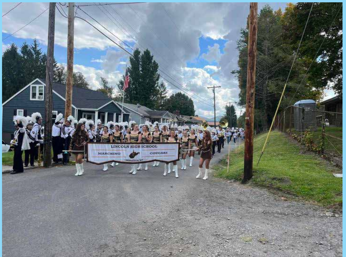
The Lincoln High School Band last weekend entertained thousands of attendees at the Preston County Buckwheat Festival Parade.