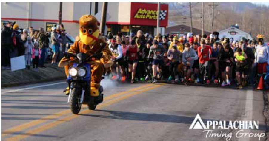
Last year, over 800 competed in the Shinnston Turkey Trot. Hundreds more joined to watch and visit.