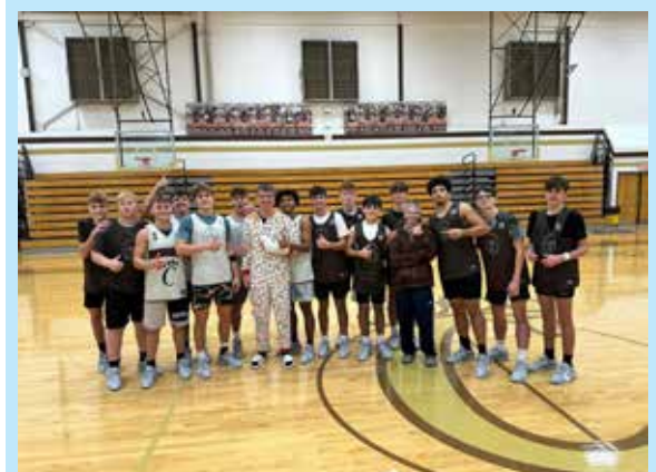
Lincoln High School boys basketball bonds over turkey, stuffing, and holiday cheer to prepare for the season