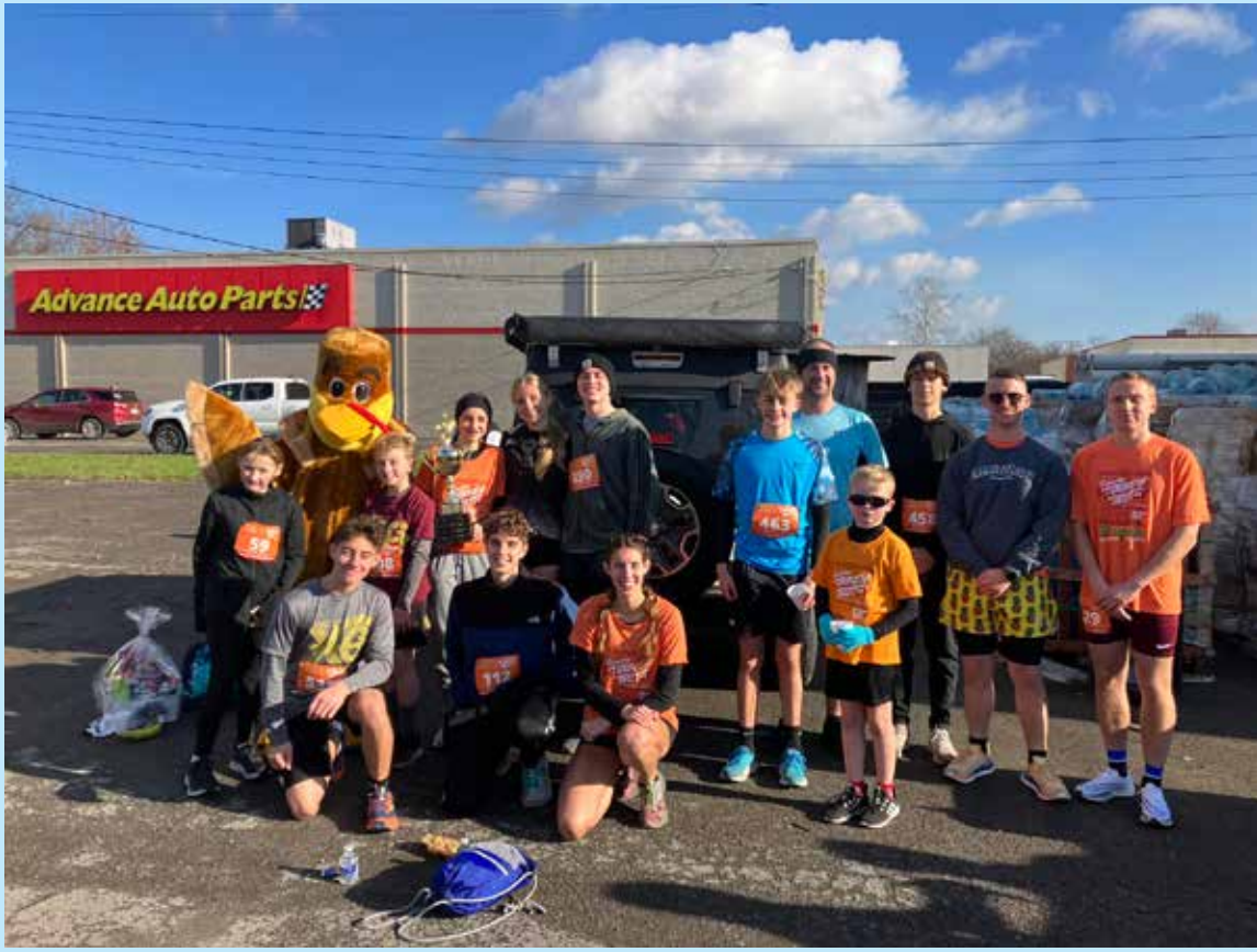
The Lincoln Cross Country Team of 73 members surged to a second straight victory in the Shinnston Turkey Trot last week. Hundreds turned out to enjoy the annual city party and competition.