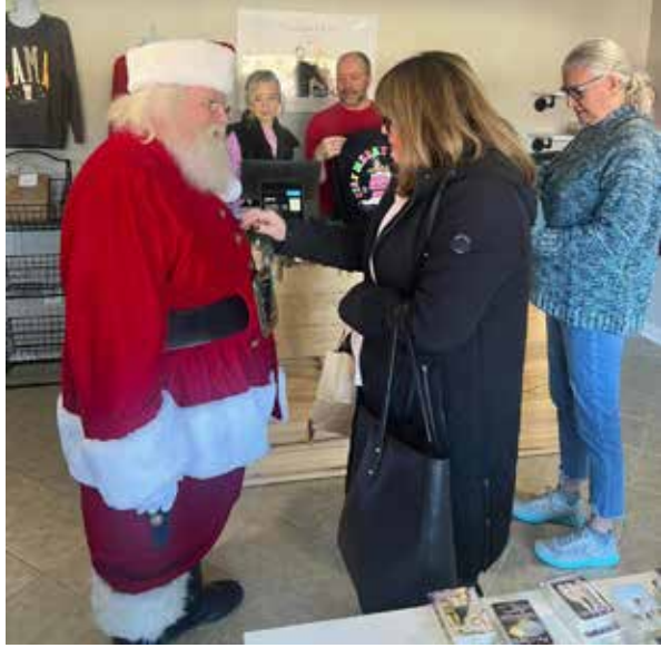
Santa Claus, also known as St. Nicholas and Kris Kringle, visited Shinnston downtown businesses last week to make sure everyone is ready for a great Christmas in 2023. He will return to town on Dec 2 at 6:30 PM as part of the city Christmas parade.