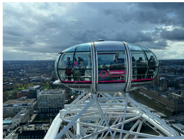
Glass pods on The London Eye.