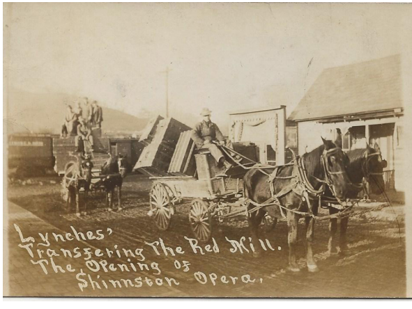
Wagon loads of furnishings roll by horse and buggy to the Opera House.

The Story Behind the Photo By Bobby Bice