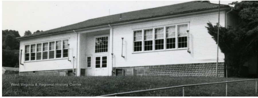
The historic Quiet Dell Schoolhouse now houses a crafts co-op and a museum remembering the Civilian Conservation Corps New Deal project.

For almost a quarter of a century, the former Quiet Dell schoolhouse has maintained its status as a building for education. Schoolchildren no longer attend classes there, but the site has emerged as a center of both history and the handing down of Appalachian handicraft traditions.