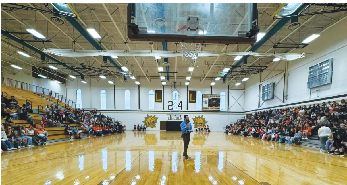
Lincoln High School holds its first day assembly for the 2024 school year.