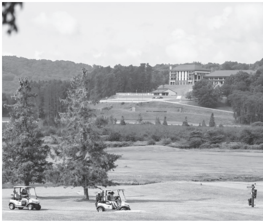
D3 drought conditions have not deprived visitors to Canaan Valley of a top golf experience.

That will do it for now. Until next time . . . take care and God Bless!