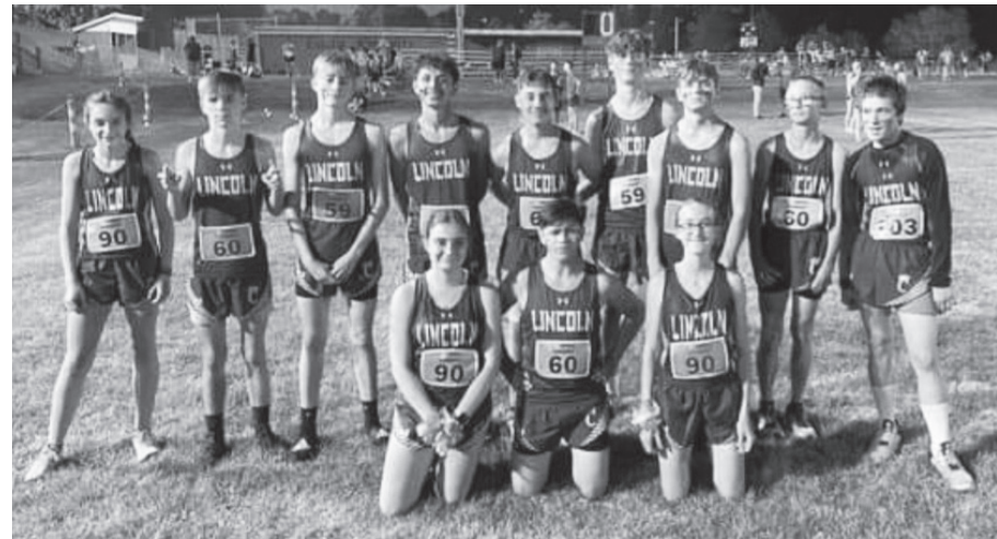
Lincoln High School's cross country team takes a group photo before competing in Kingwood.