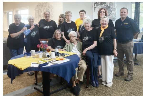
The Shinns Run CEOs hosted a “Country Roads” themed town tea party.