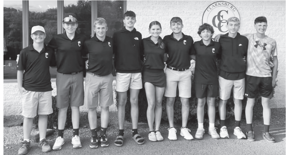
Lincoln High School's golf team had two low medalists in their win over North Marion and Fairmont Senior last week.