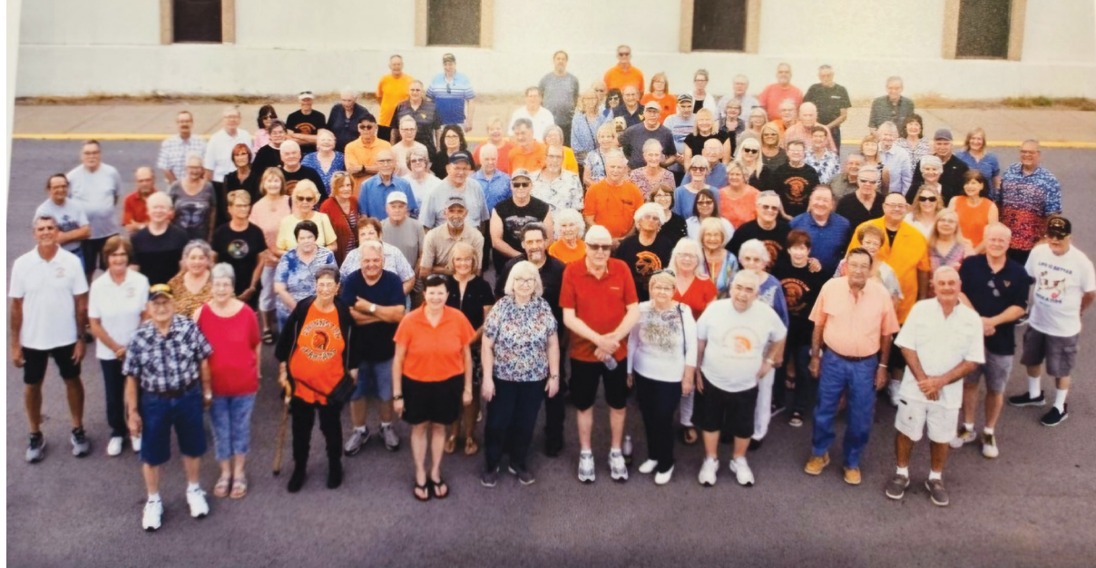
The Shinnston High School Alumni held their last planned reunion last month. Approximately 115 attended the traditional Saturday night dinner/dance.