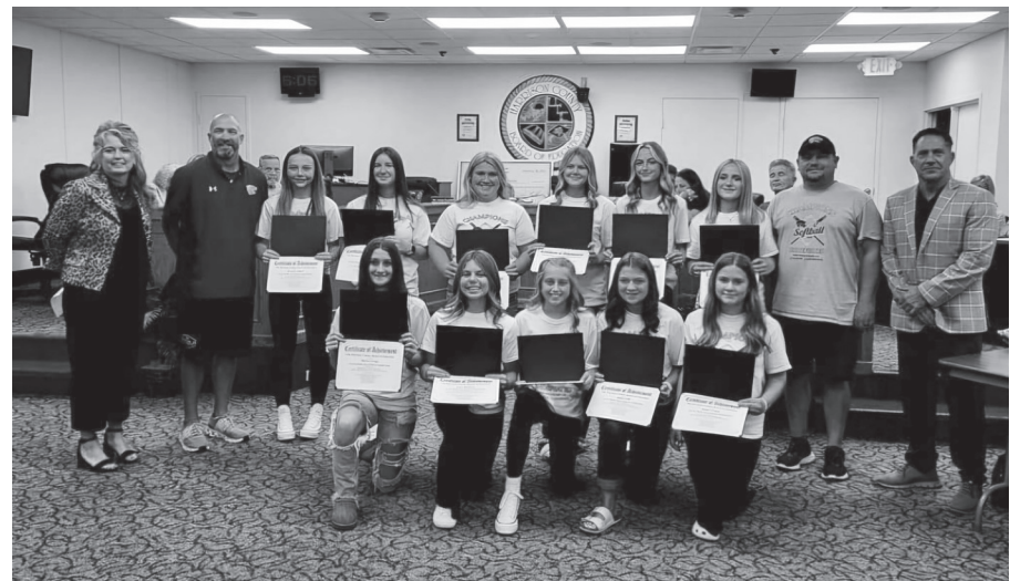
Lincoln Middle School's softball team was honored by the Harrison County Board of Education for their hard earned perfect season and conference title