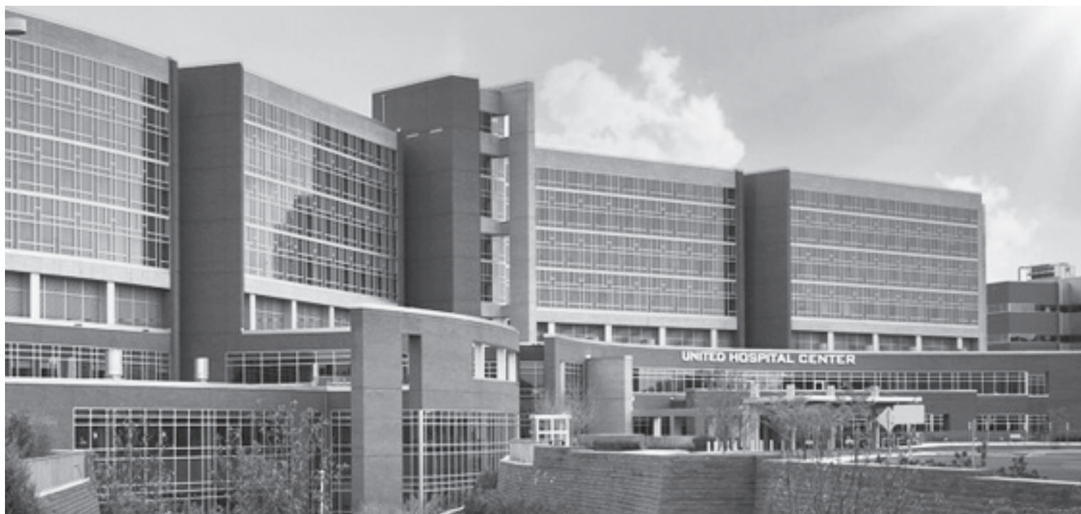
From its faith based beginnings to emerging as a crown jewel in the WVU Medicine network, United Hospital Center continues to push forward in establishing and maintaining a standard of excellence.