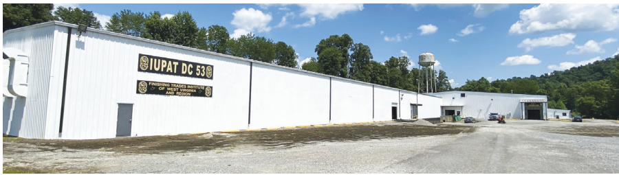
This near 100,000 square foot facility in Weston has the dual purpose of providing training in a variety of trades while also boosting the Lewis County economy.

With so many American military veterans struggling, sometimes with problems connected to their service, sometimes with the demands imposed by an uncertain and inflationary economy, support