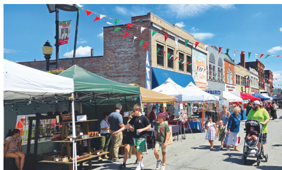
Once a year, proud Italian-American Mountaineers dress up the streets of Clarksburg to look like the madrepatria.