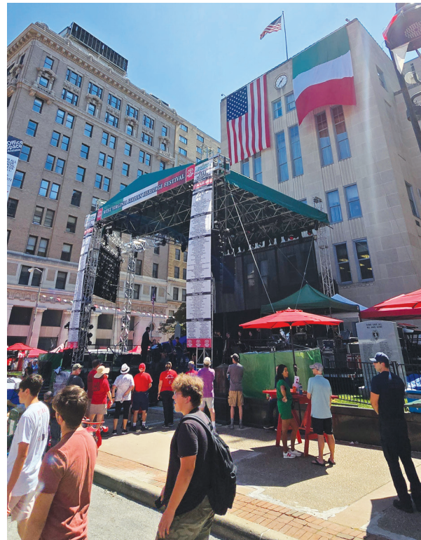
Sun and family fun greeted throngs of visitors and residents as they filled the streets of Clarksburg for the West Virginia Italian Heritage Festival.