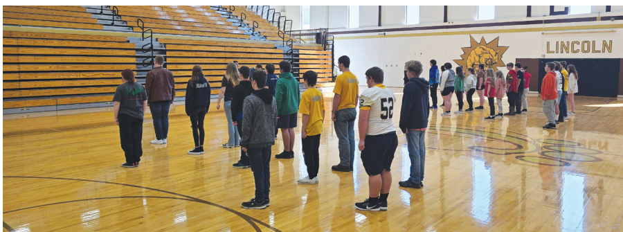
LHS JROTC cadets stand at attention as their commanding and executive officers lead them in their daily activities.

High School opened a tradition that has lasted three decades and is still going strong, its JROTC