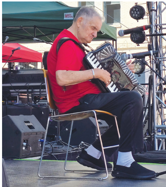
Traditional musical stylings of musicians and bands brought the feel of Italy to the festival.