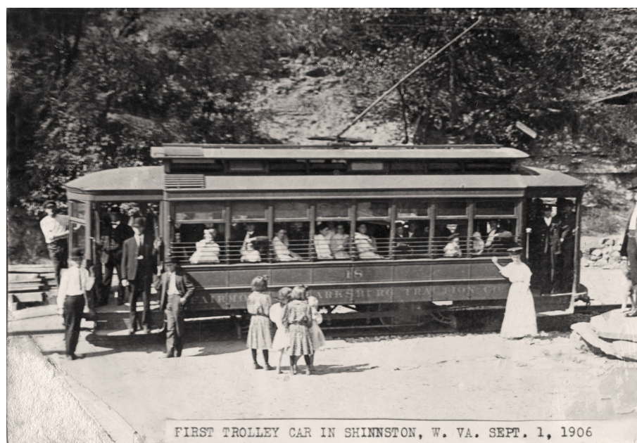
A crowded trolley car is shown in September 1906 when streetcar transportation arrived in Shinnston.

September 1, 1906 marked a memorable event in Shinnston's history when the first streetcar arrived in town. It was common for crowds to gather and anxiously await the inaugural appearance of a trolley. As evident by the accompanying image, photographers were also setup and ready to capture this moment. I've seen photos of the first streetcar coming into Grafton, Farmington, and Lumberport. Shinnston images are unique because ones were taken of not only the first streetcar, but also the second one later that day. These streetcars came from Fairmont. The one