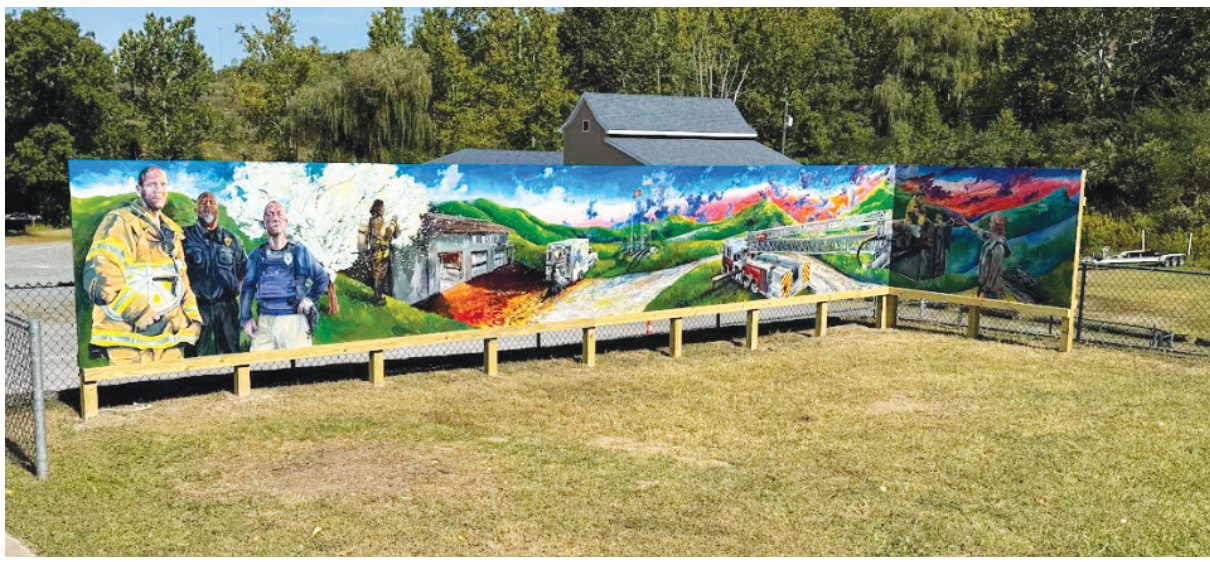
Mural of firefighters