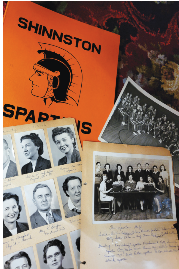
The Bice-Ferguson Museum continually receives new and interesting items illustrative of Shinnston's fascinating past.

a token from the City's Centennial in 1952. The City's quartosept centennial will be much more can be viewed at the Bice-Ferguson Memorial Museum at 400 Pike 1 pm until the end of Street, Thursday - Saturday from 9 am to October.