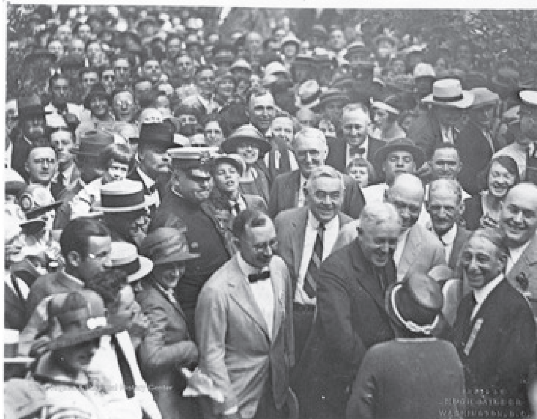
Harrison County favorite son John W. Davis greets a crowd in Clarksburg during his campaign as Democratic Party nominee for President in 1924.

Memorable photographs from around Harrison County