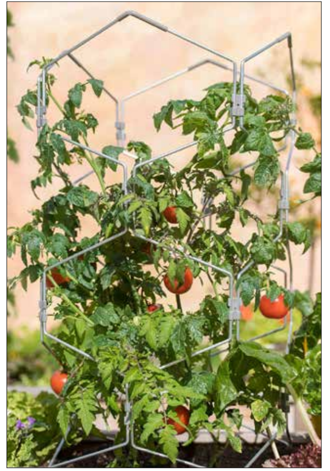
Set tomato stakes or towers in place at the time of planting and make sure they are strong and tall enough to support the mature plants.

Set stakes and towers in place at the time