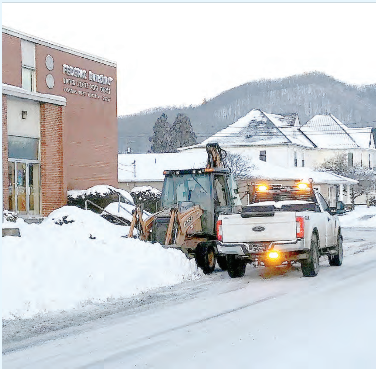
Crews were removing mounds of snow dumped on the area after a recent snow storm.