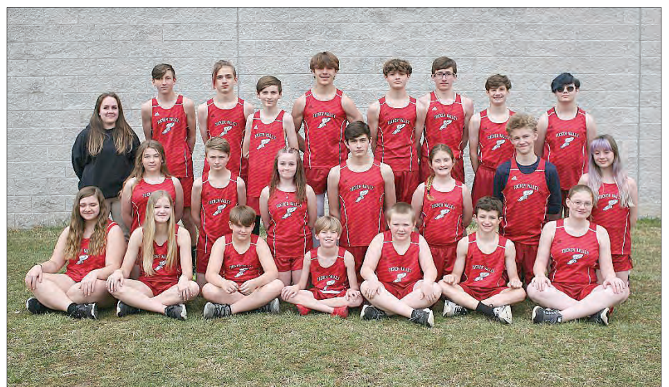
2022 Tucker Valley Middle School Track