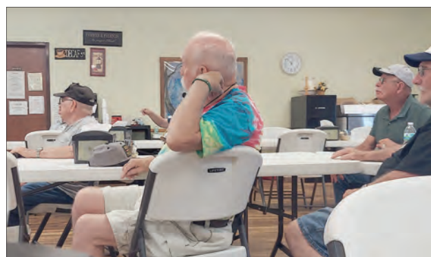
Veterans in attendance at Town Hall Meeting