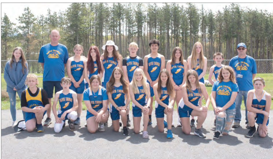
2022 Davis-Thomas Middle School Track