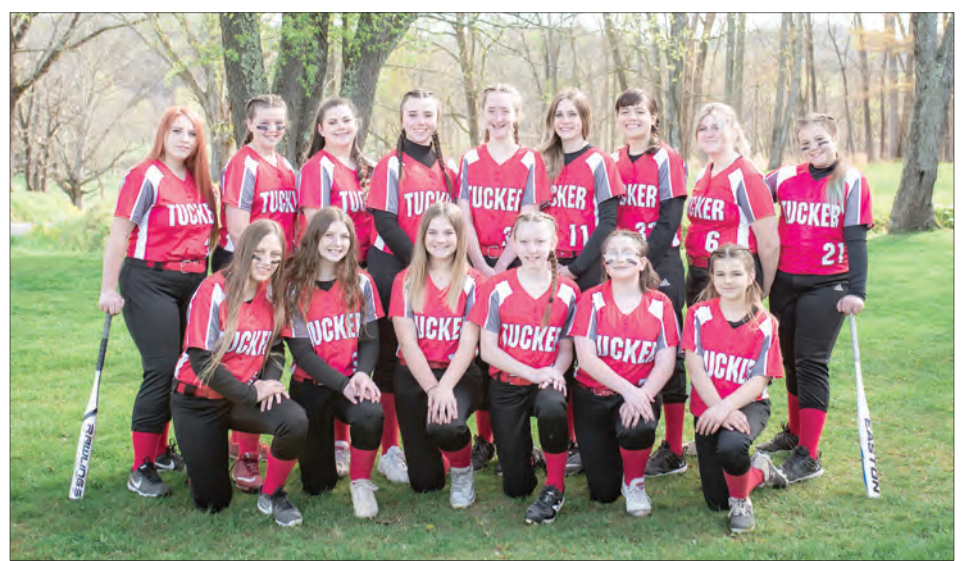
2022 Tucker Valley Middle School Softball

TUCKER COUNTY ANIMAL SHELTER 304-478-6232 304-704-4405