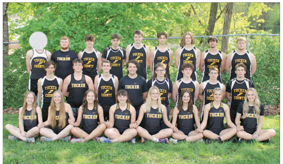
2022 Tucker County High School Track