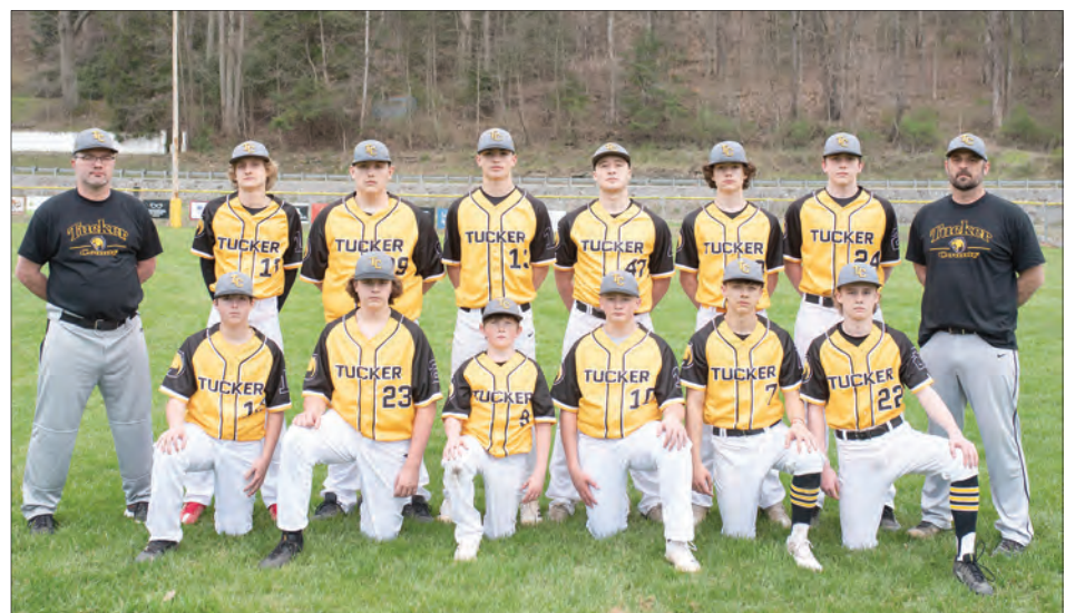
2022 Tucker County High School Baseball