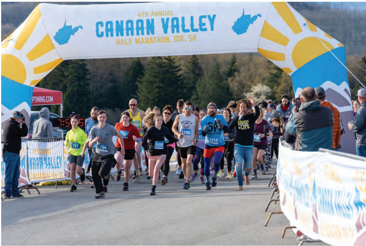
600 Runners kick off the start of the Canaan Valley Running Company's 2022 season with the start of the Canaan Valley Half Marathon, 10K, and 5K

DAVIS, W. VA. - The Canaan Valley Running Company recently hosted 600 runners, along with 600 spectators, as they kicked off their fourth racing season on April 30-May 1, 2022 with their flagship race, the Canaan Valley Half Marathon, 10K, and 5K. The race, which was held at the Canaan Valley Resort in Davis, West Virginia, and sponsored by Mountain Top Realty and Canaan Valley BBQ, gave runners the ability to enjoy the thrill of competition, while taking in the scenic beauty of Canaan Valley.