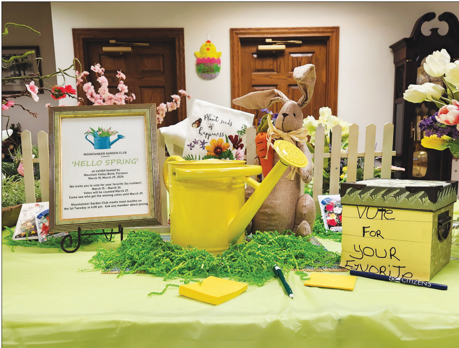
The Mountaineer Garden Club's Hello Spring is now on display in the lobby at MVB until March 29th. Stop in and vote for your favorite. This annual display raises funds to send local children to 4-H camp each year. MGC meets monthly the first Tuesday of each month at 6pm at the Five Rivers Library. New members are welcome to attend.